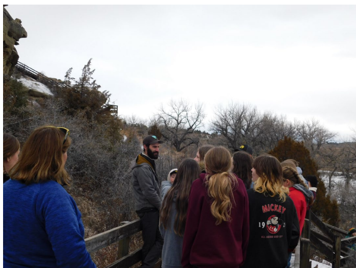
School group visit