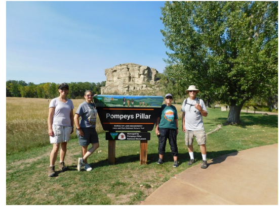
National Public Lands Day Volunteers