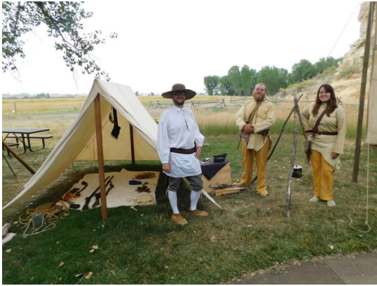
Volunteers for Signature Day's Reenactment