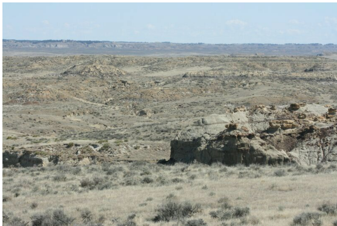
Pumpkin Creek West Entrance

Continued to increase LEO patrols and Park Ranger presence during hunting season. Continued signing efforts, replace, and install as needed. Continue to monitor and modify SRP permits as requests /applications are received.