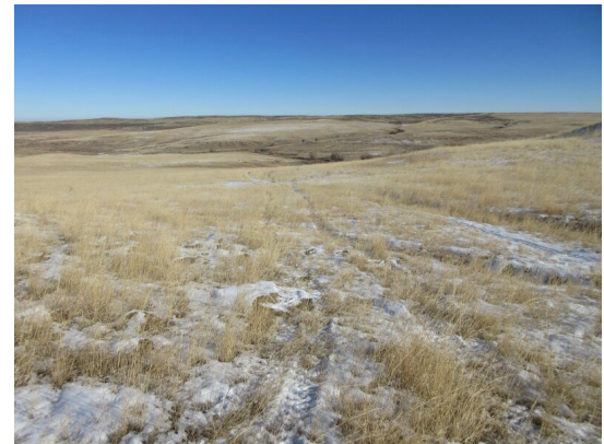
Off road travel documentation during hunter patrol

Worked with Law Enforcement (LE) monitoring 2.7 million acres of public lands. LE does a majority of the monitoring work for the SRP program. Working with LE the park ranger completed a re-signing of the Knowlton travel management area. 31 signs and post were replaced to increase visibility for the users to increase compliance with travel routes both closed and open for travel. Also re-signed 18 signs on the Hay Draw travel management that were damaged by cattle and repaired creek crossing.