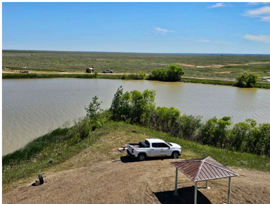
Arial view of newly installed picnic shelters