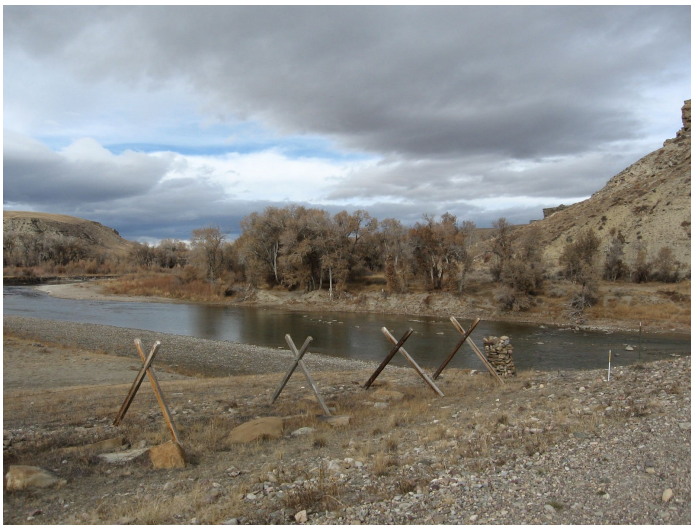
Sullivan Bridge Recreation Site

Soon, vault toilets will be installed at two different recreation sites. One will be at the headwaters of the Marias River near Sullivan Bridge, south of Cut Bank, MT and the other at Black Jack Butte in the Sweet Grass Hills North of Chester, MT. Picnic tables, fire pits, gravel, and other improvements will also be made.