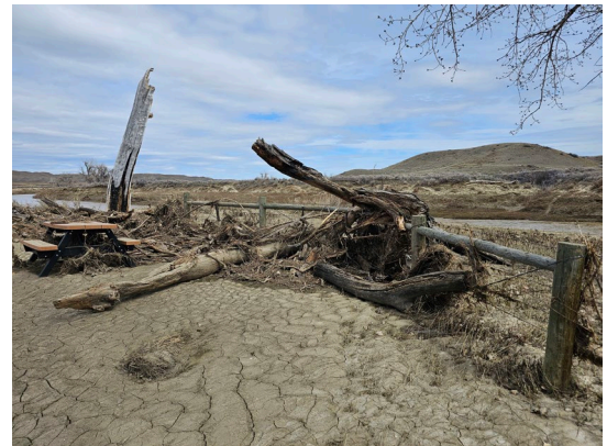
Cottonwood Flood Damage