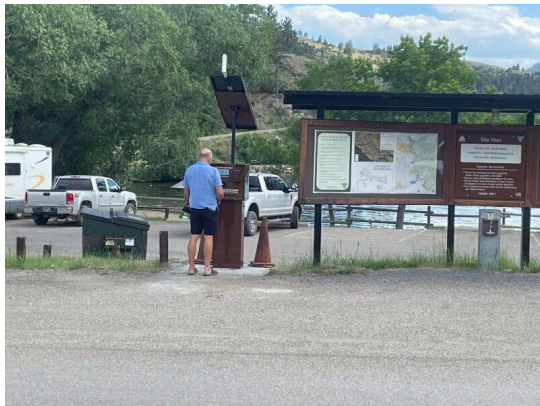
Recreation User Pays Fees on a New ROK