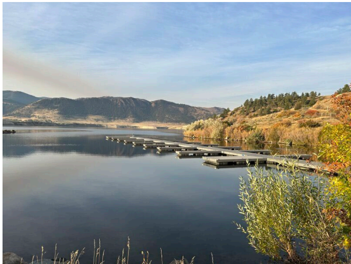
Holter Lake Recreation Area in October