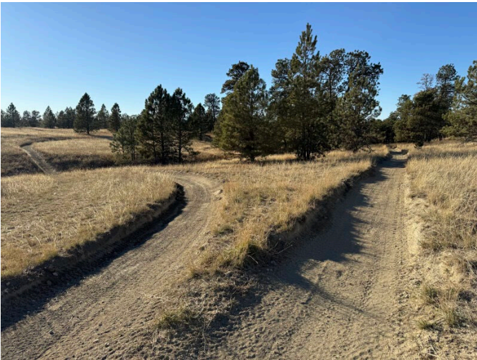
Shepherd Ah-Nei Rec. Area OHV maintained trails.

In 2025 the BiFO plans to use 1232 funding in order to match a Trail Steward Grant we received from the State to bring on an OHV steward for our field office during the summer season. We also plan to update trailhead signage at Shepherd Ah-Nei Recreation Area and perform upkeep on trailhead amenities.