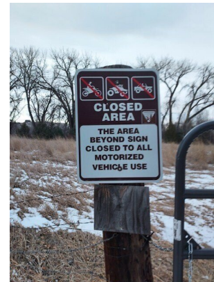
Sign installed by seasonal ranger.