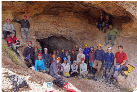
Cave & Karst Management Training group photo.