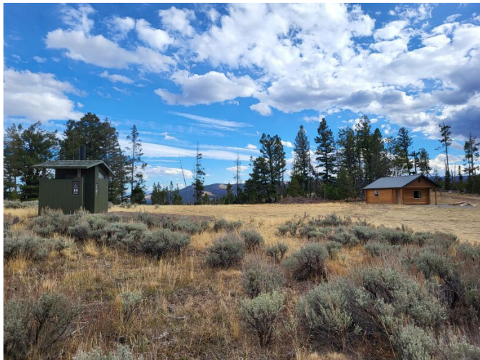
Tarpons Roost Cabin Site

Installation of the dump tank at McFarland Campground: $5,000.