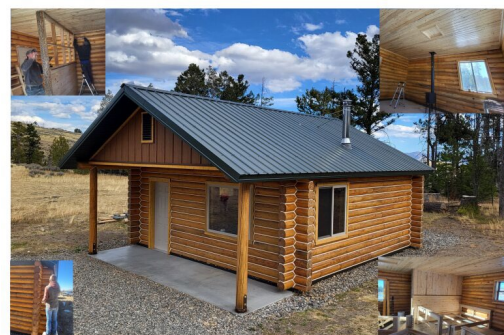
Tarpons Roost Cabin