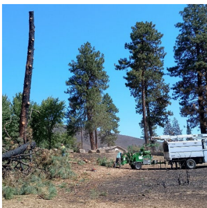
Hazardous Trees at McKay's Bend Recreation Site