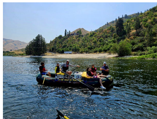
Participants on the Lower Salmon River (LSR)