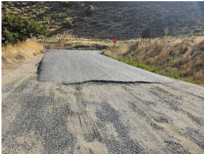
Entrance at Shorts Bar Recreation Site on the LSR

In FY25, the CFO will continue to spend fee revenue to purchase supplies, equipment, and services to operate and maintain recreation sites on the Clearwater and Lower Salmon Rivers.