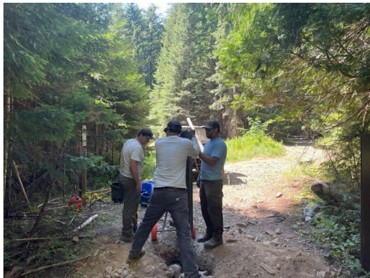
BLM Staff Installing Metal Sign Posts Near Trail