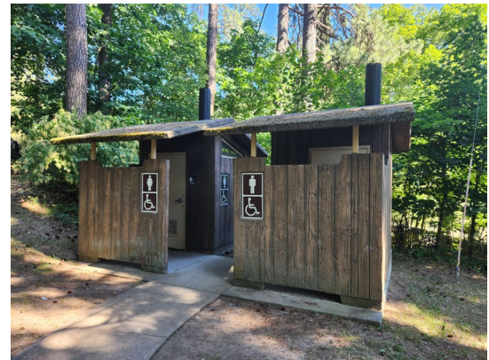
Vault Toilets at Mineral Ridge Trailhead