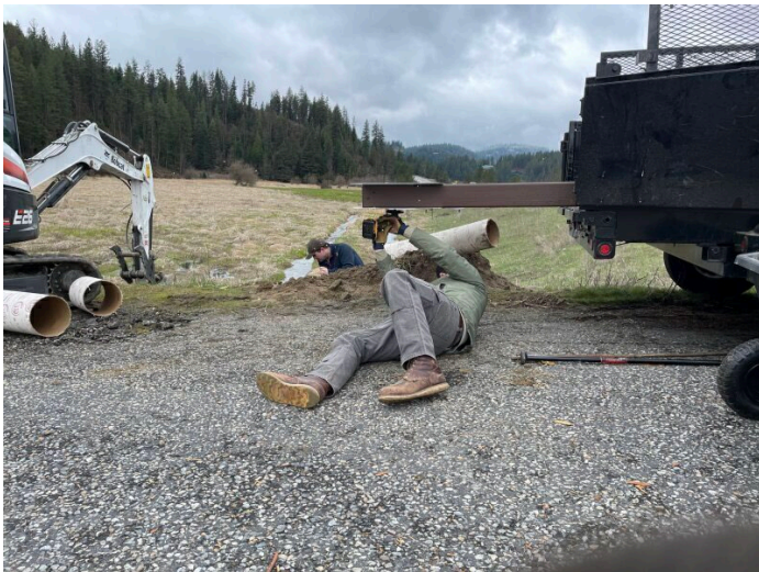
Signage Installation at Trailhead

Replace fee signage at six recreation sites to implement new business plans: $10,000.