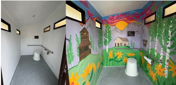
Photo of re-painted campground restrooms