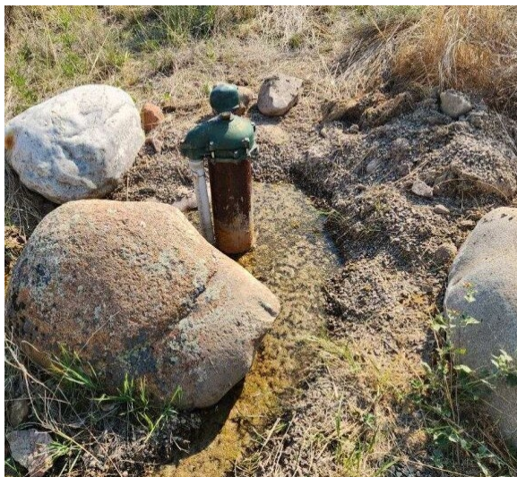
Photo of leaking wellhead at Cottonwood Campground

FY 2025 Idaho Strategic Recreation Fund contribution: $6,716.06 (shown as overhead cost).