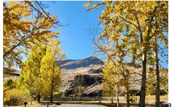
Photo of campsite at Cottonwood Recreation Site