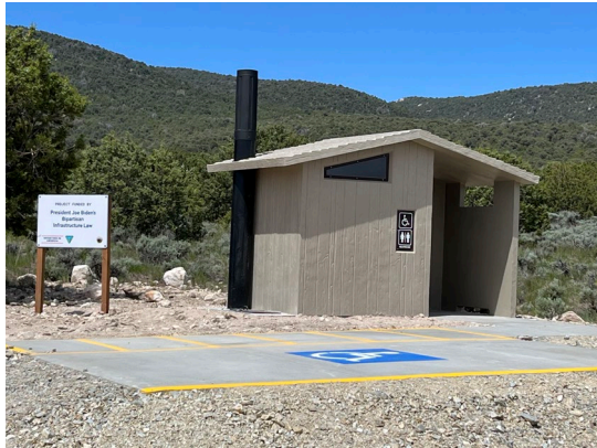
Vault Toilet at Pinyon Pine Campground