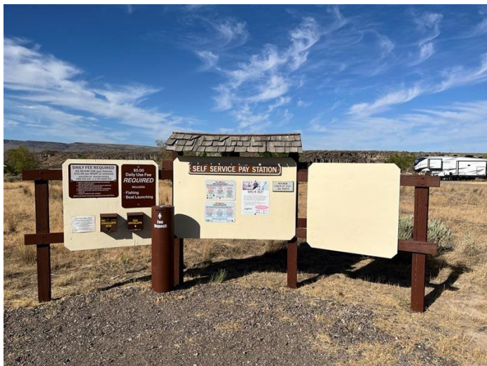
Lud Drexler Campground Kiosk Roof