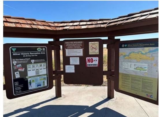
Repainted Entrance Kiosk at Milner Historic Campground

The Burley Field Office installed a new vault toilet at Pinyon Pine (formally known as Smokey Mountain) dispersed campground. The new vault toilet is a permanent solution to the health and safety issues caused from human waste left by campers. Funds were used from the campground fees collected at both Lud Drexler and Milner Historic Recreation Area (Milner), along with Bipartisan Infrastructure Law money, to accomplish the project.