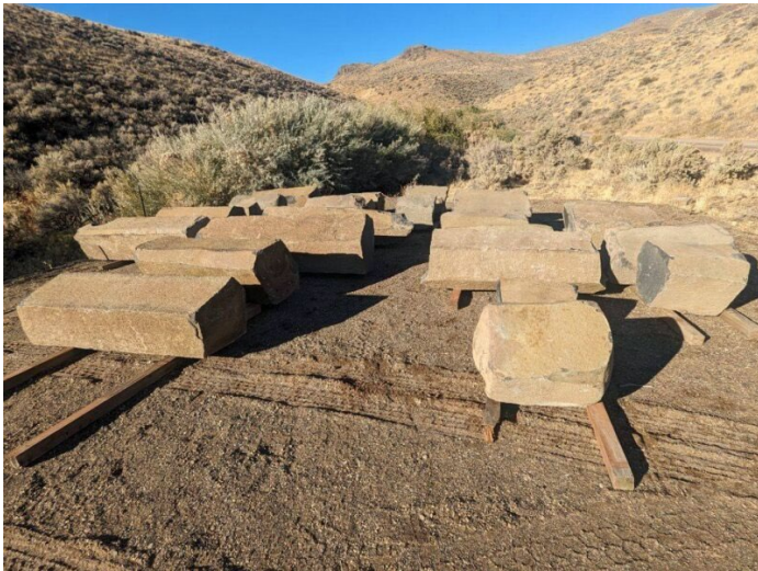
Basalt columns for the future Outdoor Classroom

The Bruneau FO is leveraging the Idaho Strategic Recreation Fund in FY24 and FY25 as matching funds for an Idaho Parks & Recreation grant. The $80,000 grant will provide interpretative educational panels, upgraded fencing, basalt columns for the classroom and a road upgrade to the classroom at Perjue Canyon, which is adjacent to the Little Jacks Creek Wilderness. Other partners providing matching funds and volunteer hours include The Wilderness Society, Backcountry Horsemen of Idaho, Sierra Club, Idaho Trails Association, and Idaho Conservation League. The Bruneau Field Office receives about $1,000-2,000 annually from 3-5 special recreation permit