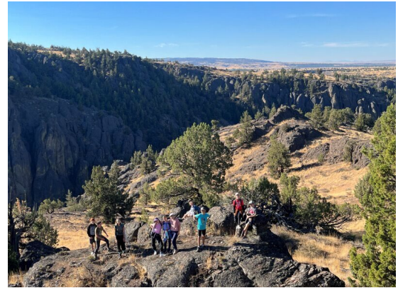
Bike Packers on break