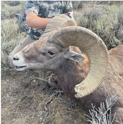
Successful Bighorn Sheep