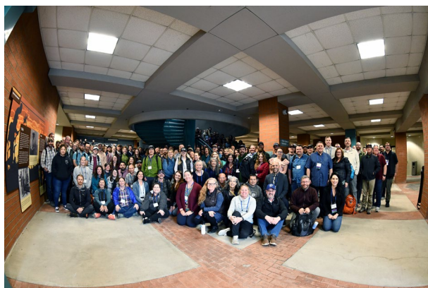
BLM participants at the Recreation Symposium