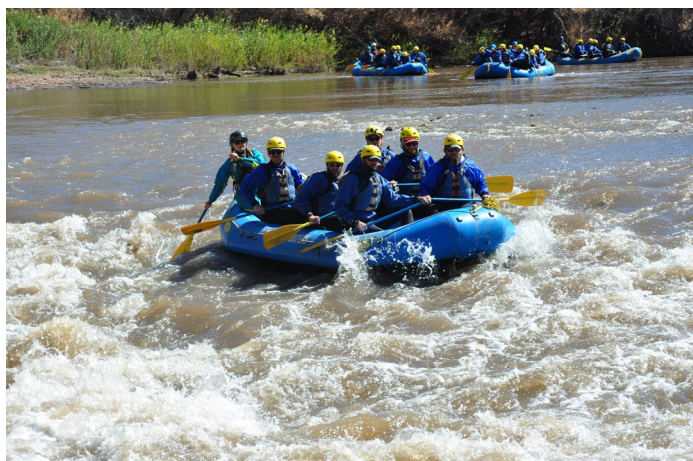
Recreation Staff participating in the Symposium

In FY25, HQ430 will initiate the planning process for the FY26 Recreation Symposium as a key accomplishment.