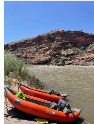
River craft at a river campsite