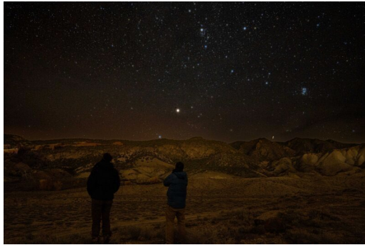
Under a clear night sky in Peach Valley, GGNCA