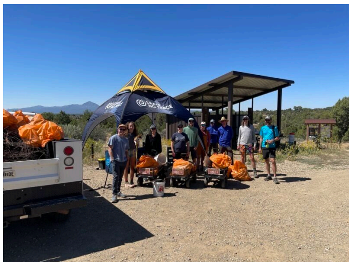
NPLD event with LNT and Local Partners

Finish Phil's World non-motorized re-routes - $2,000 Purchase new pedestal maps for the updated trails at Phil's World - $1,000 Conduct trail and sign work at Mud Springs and Chutes and Ladders - $1,000 Purchase a new kiosk for Bradfield Bridge Recreation Area - $12,000 Conduct site maintenance on the bridges in Phil's World and picnic tables at Bradfield Bridge - $750 Organize a NPLD event with LNT & partners - $500 Conduct trail maintenance & training with partners - $500