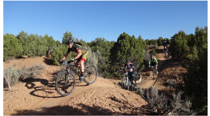
12 Hours of Mesa Verde SRP event