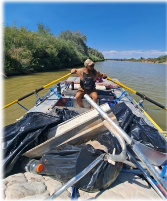
River ranger removing trash and hazards.