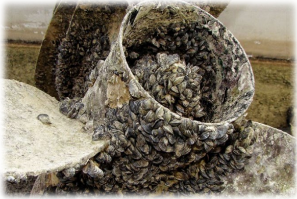
An example of the potential impacts of Zebra mussels.

Educating river users on the threat of Zebra mussels and how to abate potential spread by watercraft will be continue to be a large emphasis of FY25. Continued travel management installations will help curb resource damage in Rabbit Valley. Continued cheatgrass abatement studies and noxious weed treatments will preserve the natural setting visitor's desire.