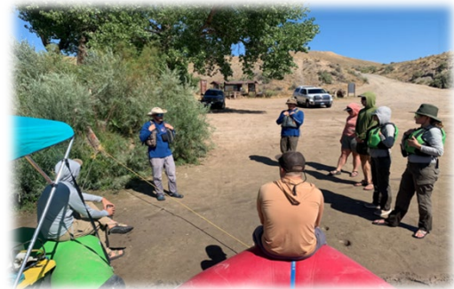
Pre-launch discussion with volunteers.