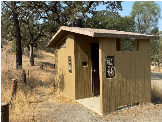
Vault Toilet Needing Maintenance

Carryover funds for FY2025 will go towards routine annual maintenance of facilities within Cache Creek Management Area, Indian Valley Management Area, and South Cow Mountain OHV Management Area. Funding will go towards staff labor and materials and supplies. Examples of activities include painting of facilities, repair of door handles and other vault toilet fixtures, gravelling of parking lots, repair of facility gates and informational signage. Planned costs are $801.15.