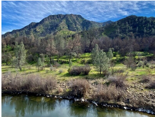
Cache Creek Fiske Creek landscape