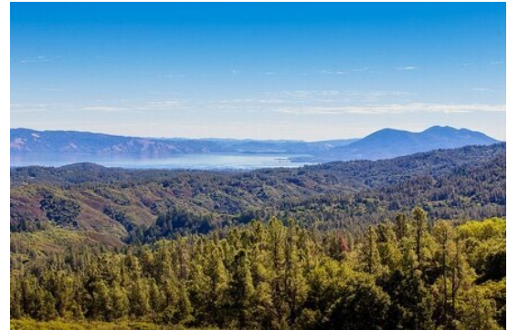
South Cow Mountain OHV Management Area landscape