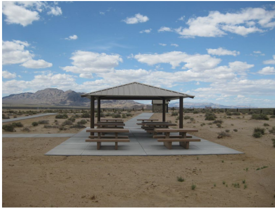
Facilities at Ivanpah Windsailing SRMA