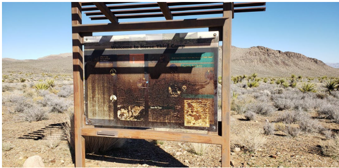
Burnt Out Signing

Numerous new signs and replacement signs will be placed throughout the Field Office these signs will replace old faded signs that were placed over 15 years ago.