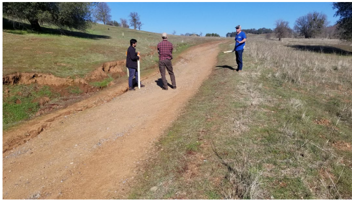
Decommissioning and rerouting trail