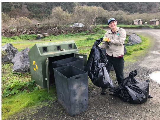
Park Ranger at Mattole Campground