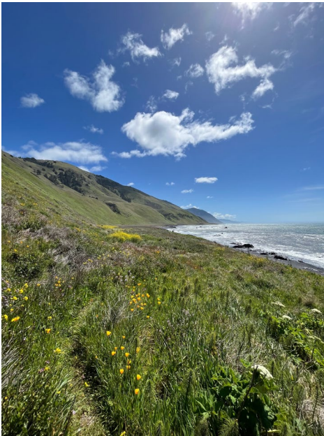
Lost Coast Trail at Spanish Ridge

On 5/9/24, the BLM published Federal Register Notice BLM_CA_FRN_MO4500174427. The King Range NCA increased campground fees to $15/night beginning May 2025 and implemented a $12 per person/trip wilderness fee to begin March 2025. Wilderness fees are projected at $135,984 and the campground fees are expected to total $40,020. These funds will cover expenditures including a seasonal ranger ($33,053), annual trail maintenance ($51,000), janitorial contracts ($60,064), and support for local fire & rescue departments ($10,000). Additional information on the 2024 Business Plan available on the King Range NCA website.