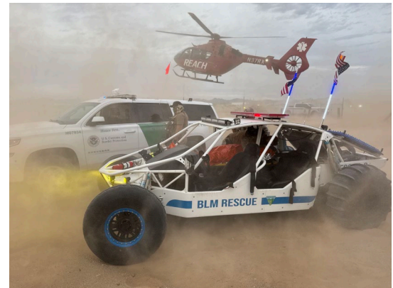
EMS & Partners Flight- Photo by R. Rubio