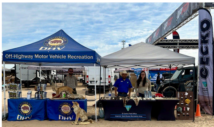
Camp RZR Outreach Event

$1.2 Mil of Carryover funding towards the New Construction of Cahuilla Ranger Station.