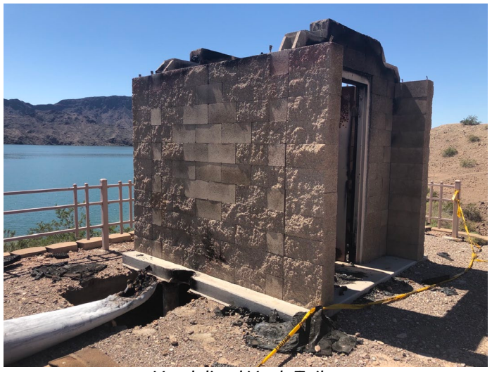
Vandalized Vault Toilet

Replace three vandalized vault toilets at several major campsite locations along Lake Havasu ($30,000 each for an estimated $90,000).