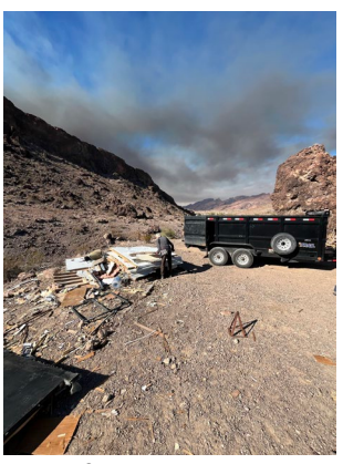
Trash Cleanup from a LHFO Recreation Area