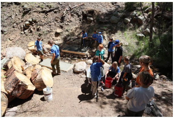
Scouts Finish Concrete Footers at Wild Cow