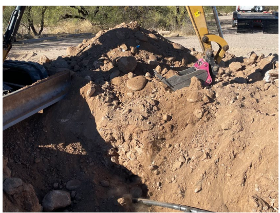
Excavator Backfills Waterline at Burro Creek