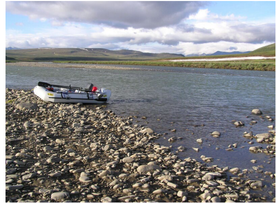
Raft pulled out of river in the NPR-A