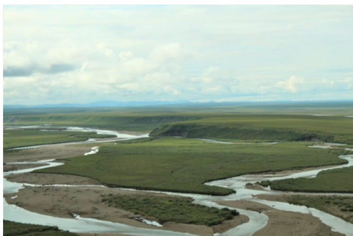
Etiwuk River before joining the Colville River

Materials for fiscal year (FY) 2025 maintenance on weather shelter along the Colville River - $150