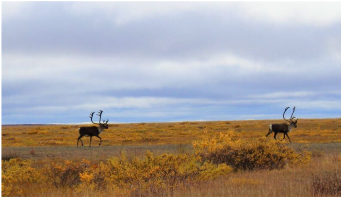
Pair of bull caribou in the NPR-A