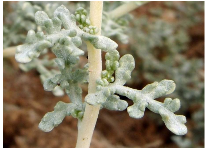
Figure 2: Burrobush leaves, showing woolly texture from hairs.

The staminate heads are many flowered 3-5 mm in diameter while the pistillate heads are two flowered without corollas (Strother 1964). Burrobush fruits are burs, purple-to-brown, each 4-5.5 mm long with 2 beaks with 30-40 long spines (Strother 1964, Schoenerr 1992). During drought, burrobush becomes dormant by dropping its leaves to prevent water loss. It is recommended to rely on the presence of longitudinal stripes on the bark for field identification during this time (Schoenerr 1992).