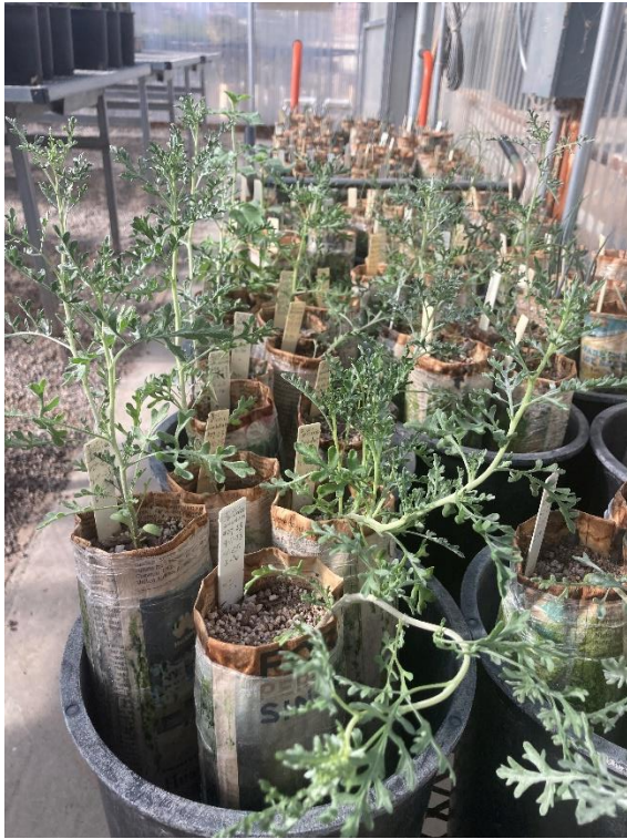
Figure 9: Burrobush in cultivation in newspaper pots at Joshua Tree National Park.

nursery, which are treated with a mild insecticidal soap (Graham 2022, personal communication).