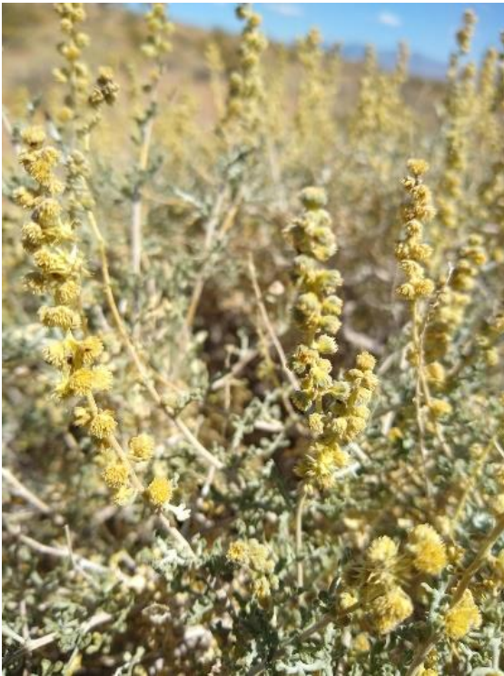
Figure 3: Burrobush in flower.