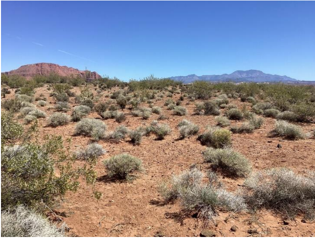
Figure 5: Burrobush growing in open desert in Utah.

brittlebush ( Encelia farinosa ), water jacket ( Lycium andersonii ), Fremont's chaffbush ( Amphipappus fremontii ), shadscale ( Atriplex confertifolia ), desert-holly ( Atriplex hymenelytra ), Mojave yucca ( Yucca schidigera ), ocotillo ( Fouquieria splendens ), cheesebush ( Hymenoclea salsola ), and others.