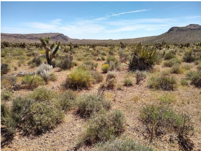
Figure 6: Burrobush growing within the Nevada desert. BLM SOS NV052