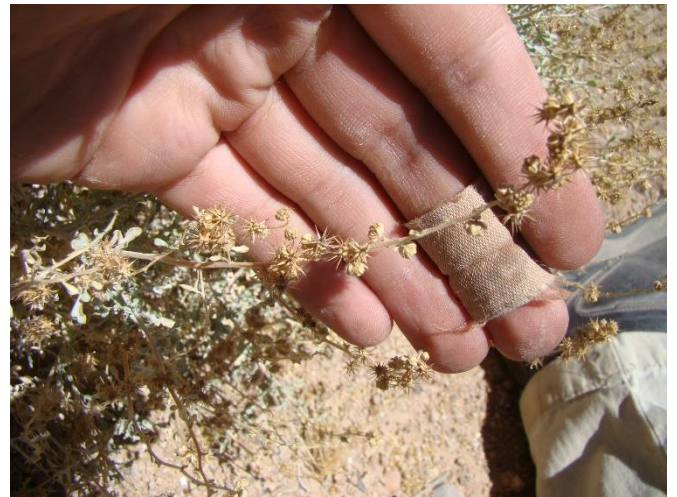
Figure 8: Burrobush burs post-harvest (top) and attached to spike pre-harvest (bottom).