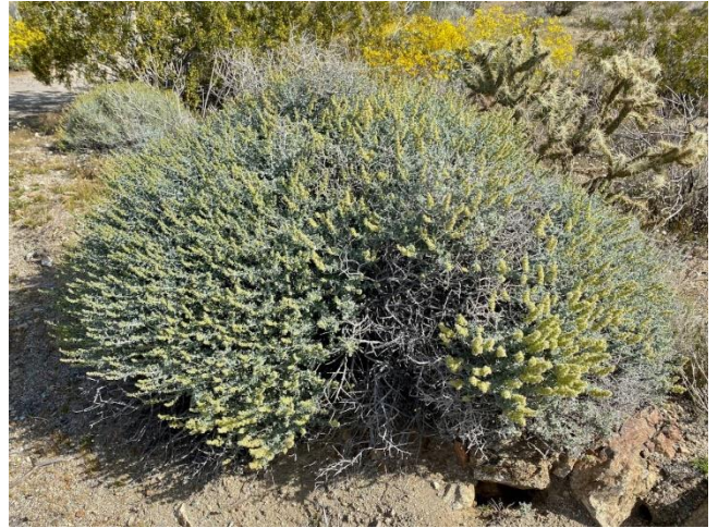
Figure 1: A burrobush individual.

Each blade is ovate, 2-3 pinnately lobed and approximately 10-25 mm long. Burrobush flowers are yellow with pistillate (female) and staminate (male) heads intermingled on a spike-like inflorescence (Figure 3).