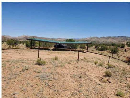
Wildlife waterer within landscape restoration area