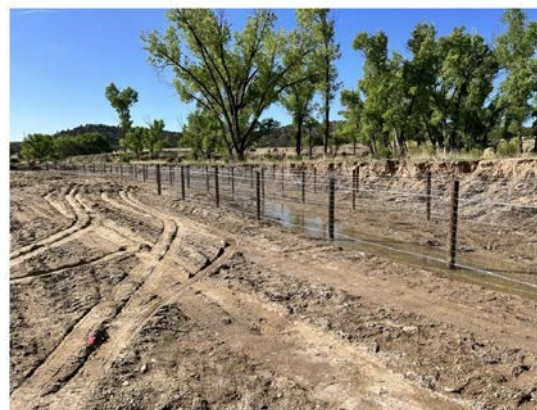
Multi-year riparian restoration project