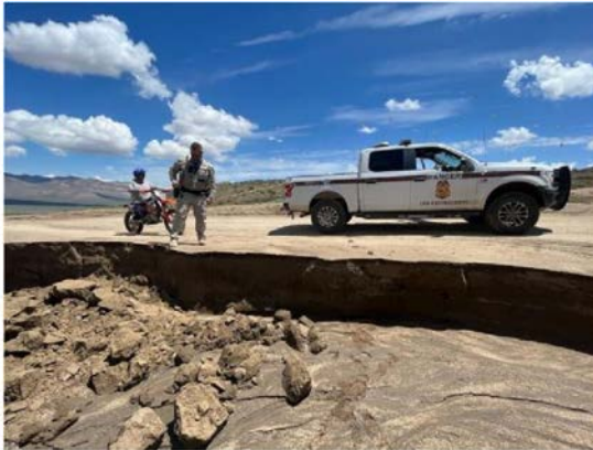
Law Enforcement staff member assesses flood damage