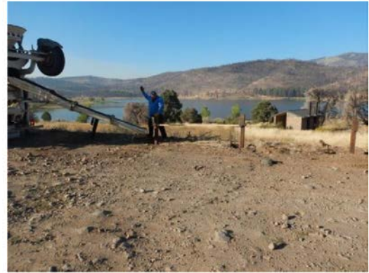
Installation of a replacement vehicle barrier

BLM, along with support from state and local partners, continued implementation of the establishment for the North Reno Recreation Area (NRR), establishing the area as a developed recreation site. This effort promotes Public Health & Safety and mitigates resource concerns. The resulting work in FY23 included the administrative site design, flood damage mitigation, increased Law Enforcement coverage for holiday weekends, and updates to site/regulatory signs, as well as a contract for restrooms.