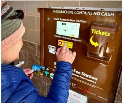
Testing an onsite ROK station