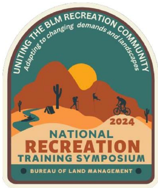
2024 Recreation Symposium Logo

2024 BLM Recreation Training Symposium Cadre Travel and Operations ($150,000)