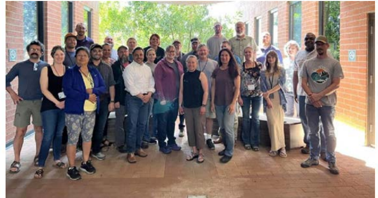
Permit and Fee training course students and instructors

With funding support from BLM-Headquarters, three BLM field offices piloted Remote Off-Grid Kiosks (ROK) at one campground and two day-use areas in 2023. A ROK is a self-contained fee payment device that accepts electronic payments anywhere, thanks to its remote access software. It offers a convenient and efficient way to process payments and print permits at these remote recreational areas.