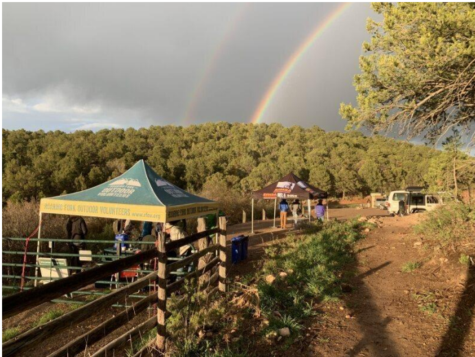
Park Rangers and Business Plan

The CRVFO plan to hire a career seasonal and permanent Park Ranger that will be partially supported by 1232 funds in FY 2024 and beyond. The CRVFO has been understaffed for many years. Having only two permanent recreation staff since 2019 and one since summer 2023 has led to a backlog of maintenance work at recreation sites and backlog of Special Recreation Permit (SRP) administration. The Park Rangers, supported by 1232 funds, will provide critical support to our recreation sites and SRP program. The CRVFO will also be implementing our approved business plan. This plan will increase camping fees from $10 to $20 per night at the Wolcott and Gypsum campgrounds and add fees at other sites.