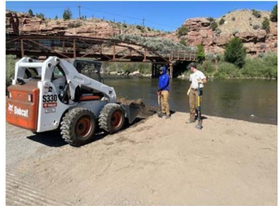
Recreation Site Maintenance