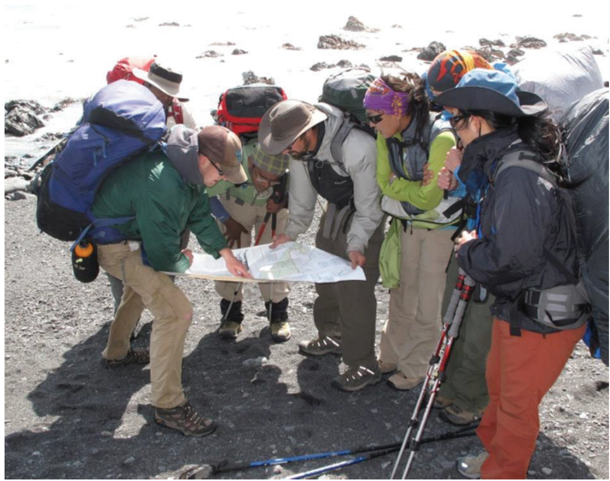
Figure 7: King Range NCA Park Ranger Assists Visitors on the Lost Coast Trail