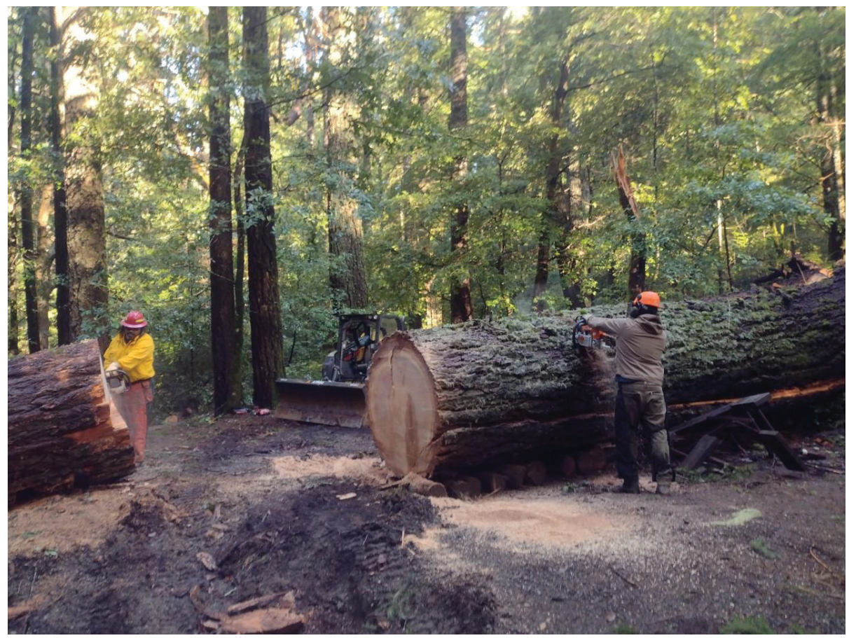
Figure 10: King Range NCA Staff Remove a Fallen Tree at a Developed Campground