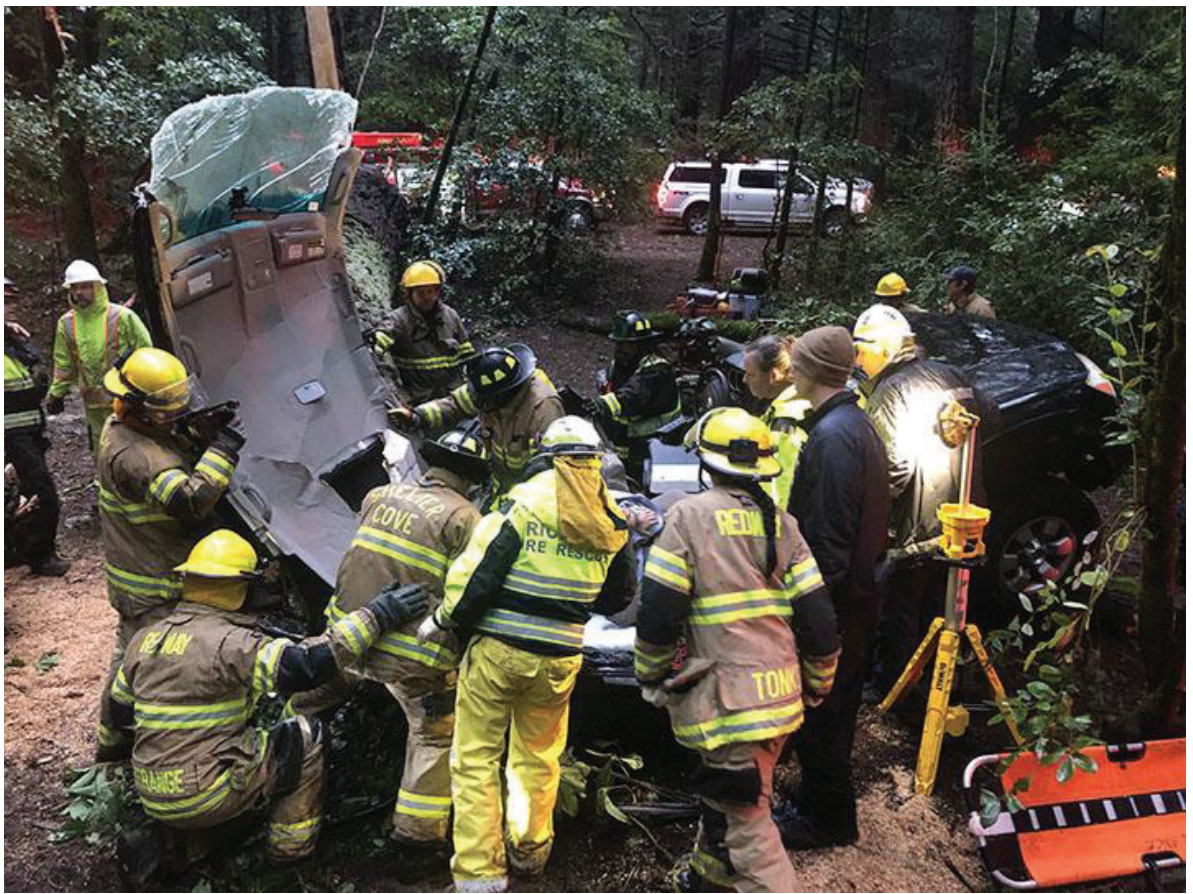
Figure 11: Local Fire Departments Perform a Rescue in a King Range NCA Campground

Provide financial support for local Search and Rescue and volunteer fire departments for equipment, supplies, and training needs. Essentially all of the rescue and emergency support received by visitors in the King Range is from local fire departments and the U.S. Coast Guard. There are typically a minimum of 3-5 rescues conducted in the King Range wilderness each year, varying from dehydration/exhaustion issues to more serious and immediate life-threatening emergencies, such as ocean rescues on Black Sands Beach. This funding could also be used as matched funding to apply for grants or other funding opportunities to enhance safety messaging, or other related unforeseen opportunities.