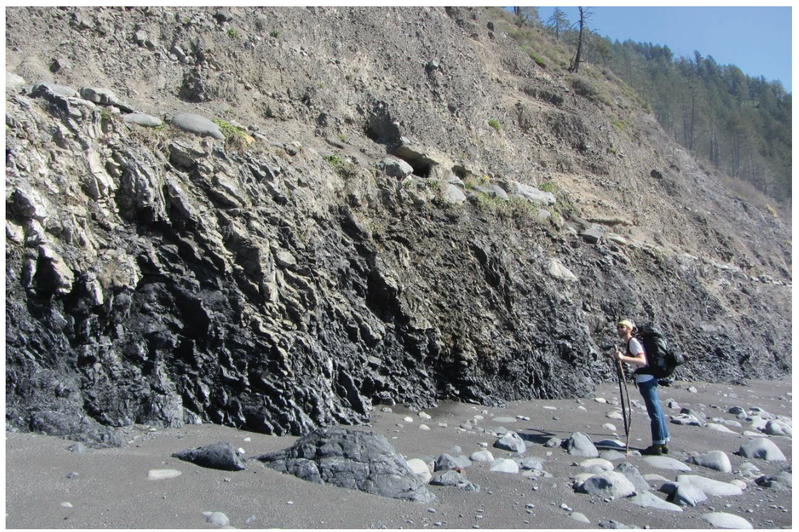
Figure 5: Steep Topography Along the Lost Coast Trail

A Government Performance and Results Act (GPRA) visitor survey conducted at recreation sites throughout the King Range NCA on 21 days between July 2 and September 24, 2021, indicated the top five recreation activities that visitors participated in (note that visitors could select multiple answers) were hiking/walking (79%), sightseeing (58%), camping (42%), picnicking (39%), and birdwatching/wildlife viewing (36%).