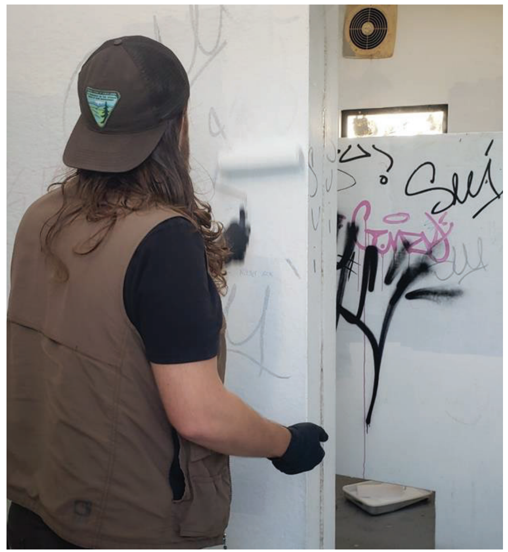
Figure 9: Park Ranger Removing Graffiti from Restroom Wall

Campground fees are collected from the "iron rangers" and transported to a secure location where information from the envelopes is entered into a spreadsheet. The collected fees are then processed and deposited by administrative support staff.