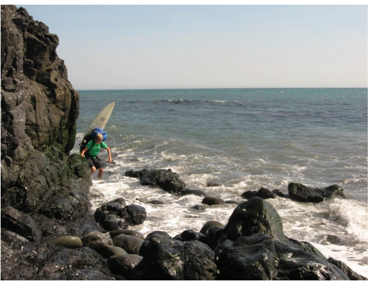
Figure 6: Hiker on the Lost Coast Trail

In addition to using the campgrounds specifically for camping, many visitors use the campgrounds as base camps to explore other King Range NCA facilities (hiking & biking trails) or visit other local attractions like Shelter Cove and Sinkyone Wilderness State Park. Tolkan Campground has become a camping and mountain biking destination, reflected in the doubling of use after the 2008 completion of the Paradise Royale MTB Trail System.