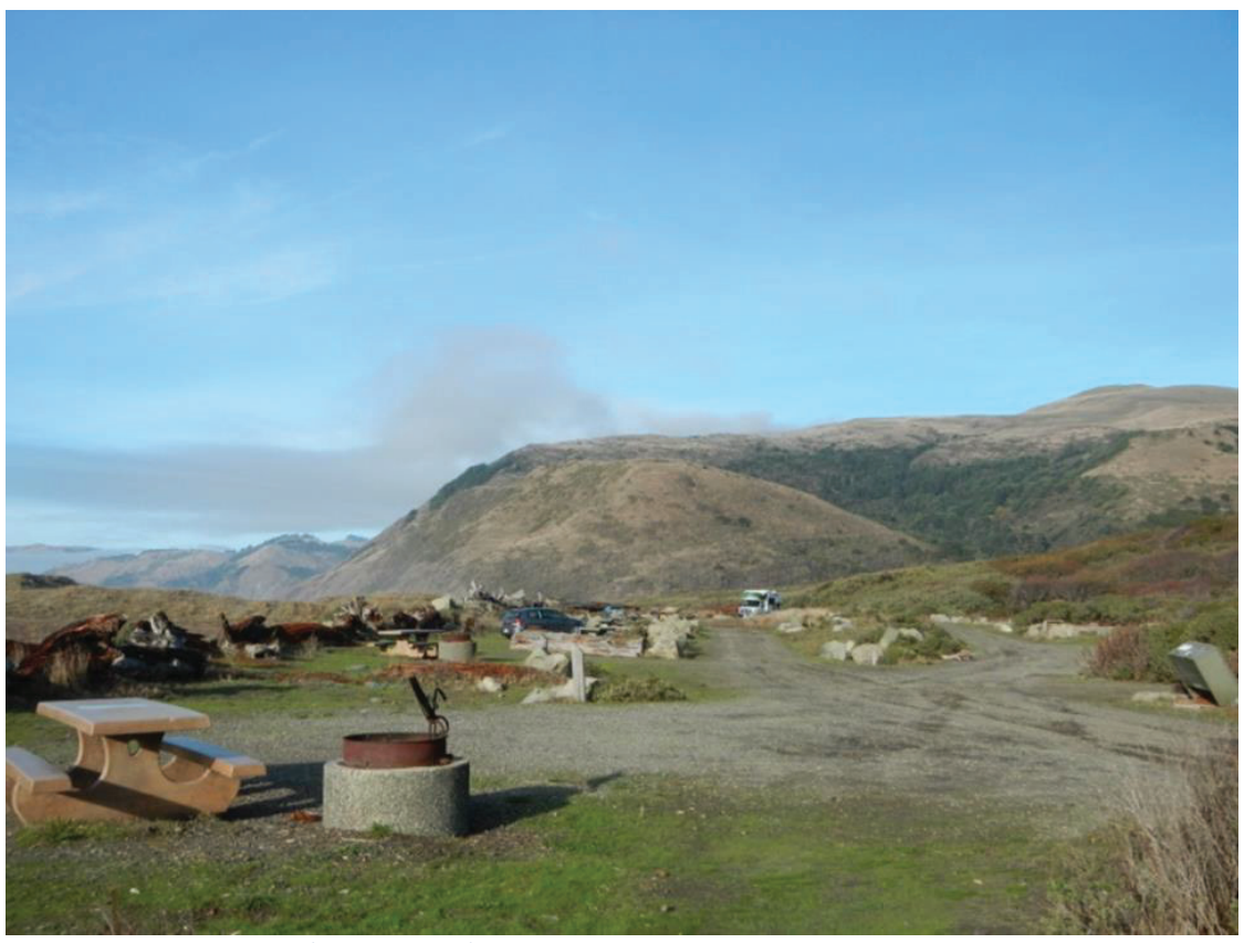
Figure 3: Campsite at Mattole Campground