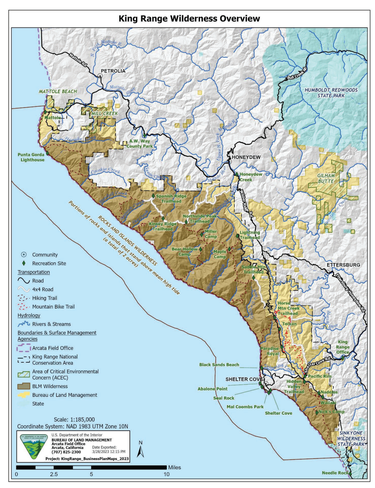
Figure 2: King Range NCA and King Range Wilderness Area Map