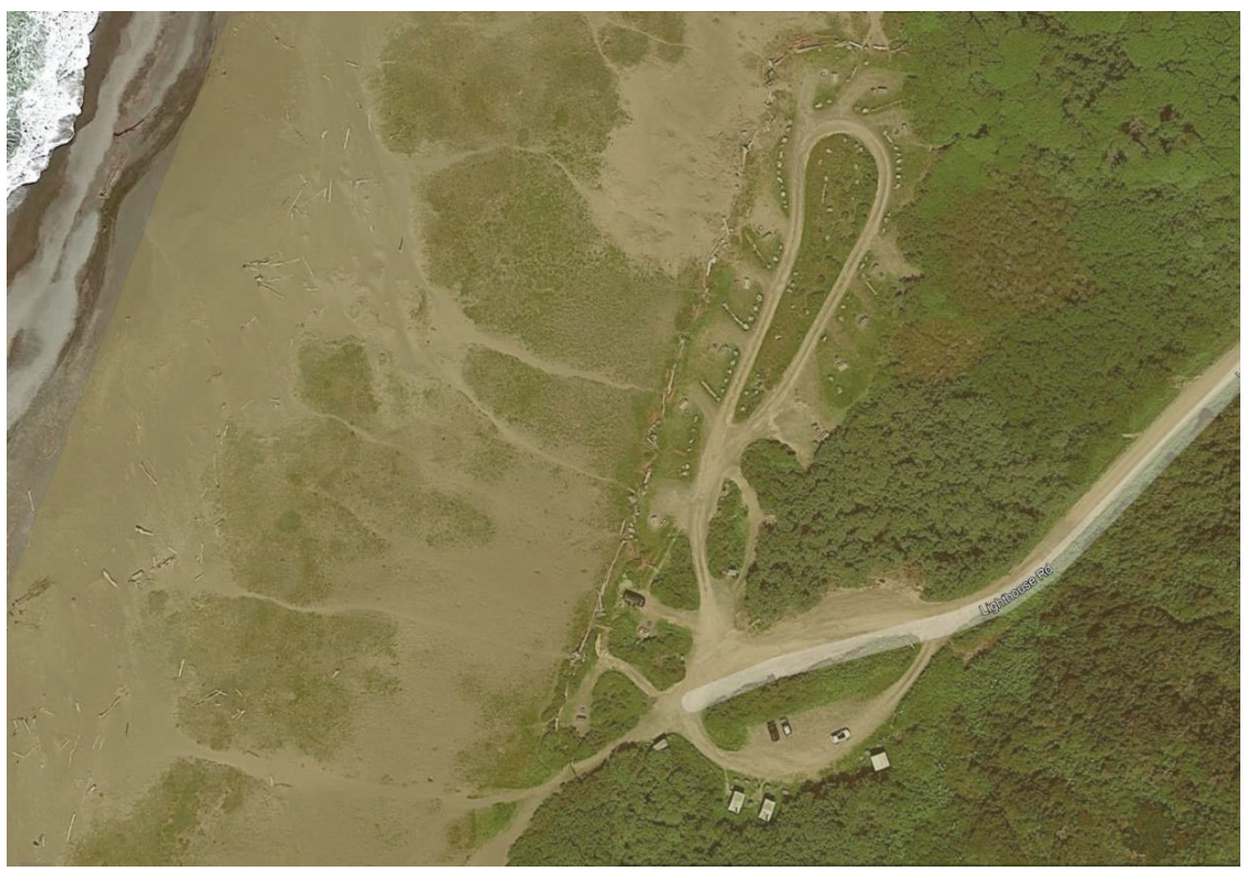
Figure 4: Satellite Image of Mattole Campground and Mattole Trailhead