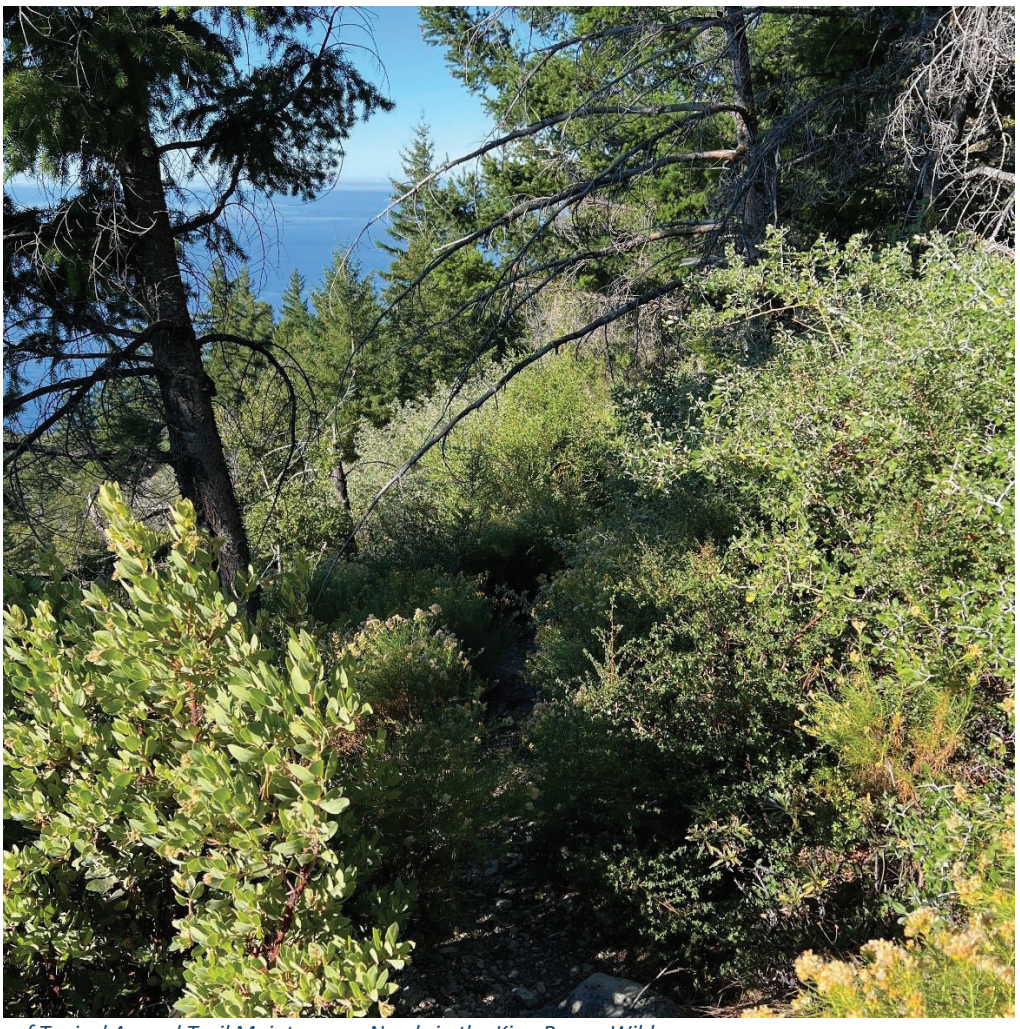
Figure 8: Example of Typical Annual Trail Maintenance Needs in the King Range Wilderness

Labor costs for wilderness management include trail condition assessment and maintenance performed by BLM King Range staff, supervision of and support logistics for hosted workers (e.g., California Conservation Corps, Student Conservation Association, and American Conservation Association), and the recruitment, training, and supervision of volunteers, such as American Hiking Society and Wilderness Volunteers. Operational costs include employee per diem (camp rate is currently @$40/day) for overnight tours of duty, and BLM provided supplies and equipment (e.g., water filters, stoves, tents, communications equipment), hand tools (shovels, pulaskis, McCleods, digging bars, loppers, hand saws, cross-cut saws), first-aid and safety equipment, and food for volunteers.