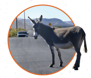
More wild horses and burros on highways and private property in search of food and water