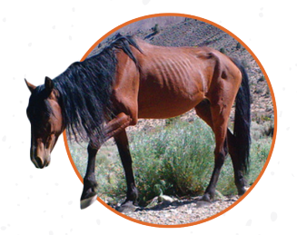
Starvation and thirst for horses, burros and other wildlife

Overpopulated herds threaten land and herd health. Too many wild horses and burros can lead to: