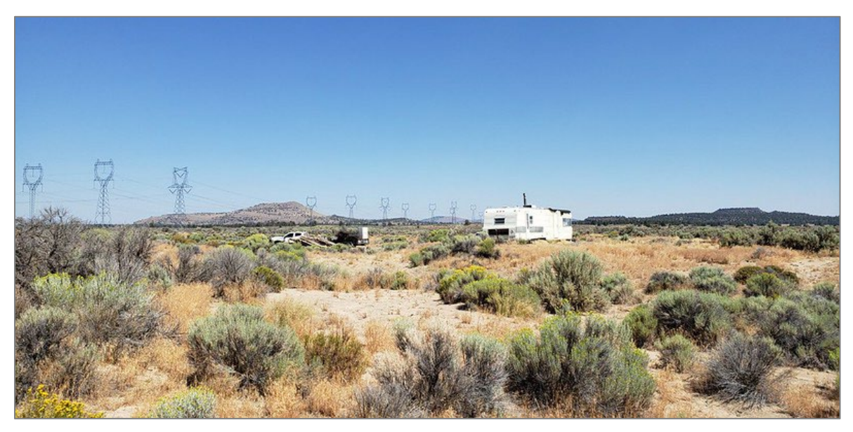
BLM employees and a volunteer removed trash from an illegal camp on public land in south-central Oregon, July 31, 2020.