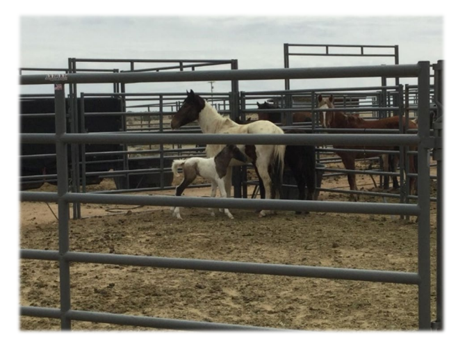
Mare and foal in pen at Bloomfield facility