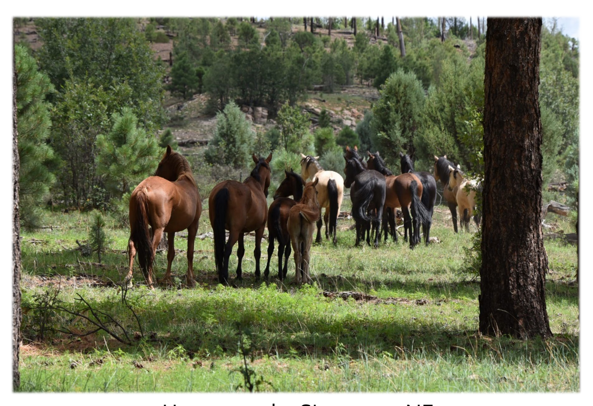
Horses on the Sitgreaves NF