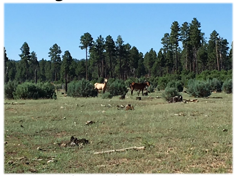
Two horses on the Sitgreaves NF