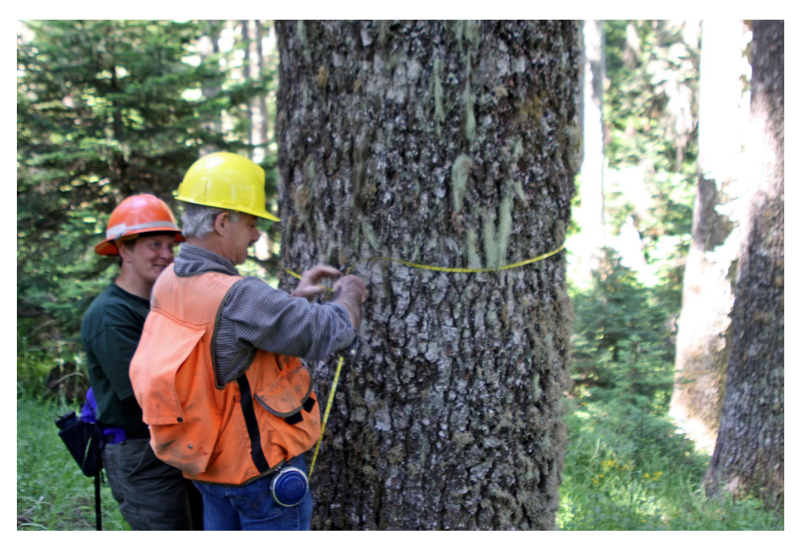
Scientists collect tree data around Mary's Peak, NW Oregon District.