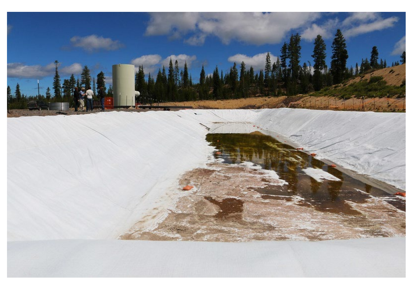
Newberry Geothermal Lease Project.