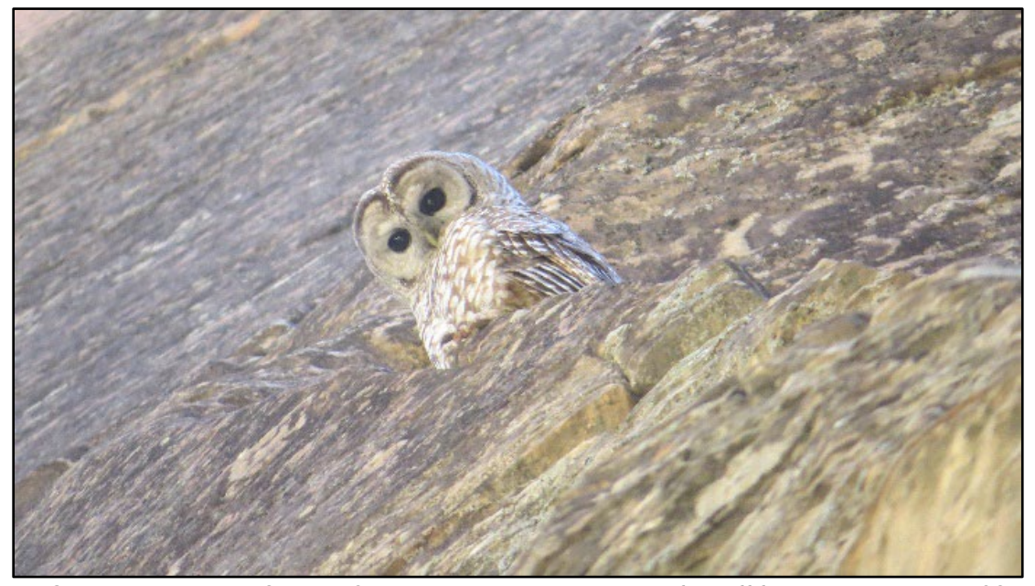
Figure 8: An adult Mexican Spotted Owl intently watches BLM wildlife staff from high above in a GSENM canyon.