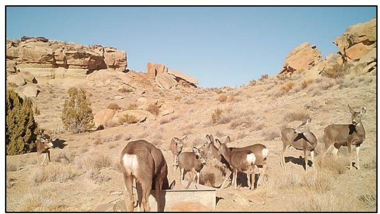
Figure 5: Guzzlers are critically important to mule deer and other wildlife on GSENM.

Grand Staircase-Escalante NM applied for and received funding from Utah's Watershed Restoration Initiative (WRI) for the construction of an additional wildlife watering facility (guzzler) in the Buckskin Mountain area, east of Kanab. The guzzler, located within crucial mule deer winter range for the Paunsaugunt mule deer herd is nearing completion. The new guzzler should help mitigate some drought impacts to wildlife in this area.