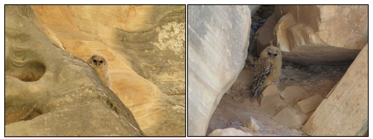
Figure 7: Left and right, juvenile Mexican Spotted Owls within a GSENM canyon.

In June 2022, after receiving two separate reports of juvenile owls thought to be abandoned within one of our local canyons, GSENM wildlife staff conducted a site visit. Not only were the owls not abandoned, but they were found to be Mexican Spotted Owls (MSO) which are a threatened species under the Endangered Species Act. In total, two juvenile and two adult MSO were discovered within the canyon. This is the first confirmed breeding pair within the canyon and an exciting discovery.