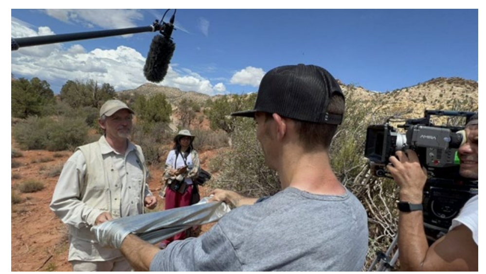
Figure 9: Dr. Alan Titus in the field filming for "Drain the Oceans-Secrets of the Dinosaurs."

The program was honored by being featured in National Geographic's "Drain the Oceans" program, which is National Geographic's fourth most popular show (average 300,000 viewers per episode) and is in the 95<sup>th</sup> percentile of documentary shows in the USA. Filming took place in July 2022 and the episode (Season 6, episode 3: Secrets of the Dinosaurs), which features GSENM research on tyrannosaurs of the Rainbows and Unicorns Quarry, debuted March 19<sup>th</sup>, 2023.