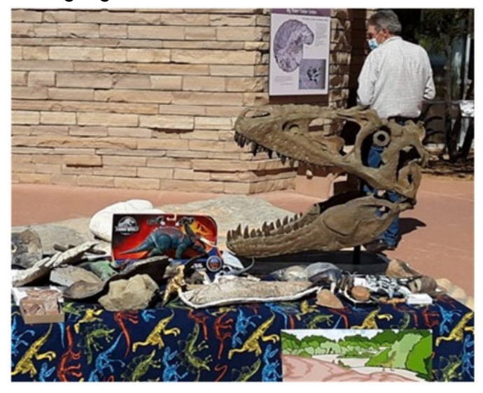
Figure 6: Display at the 2022 Fossil Day Event at the Big Water Visitor Center in Big Water, Utah.

of paleontology and the importance of preserving fossils for future generations. This years' celebration was a huge success and very well attended with nearly 300 members of the public taking part. The activities included free entertainment and activities for all ages and highlighted the importance of paleontological resources on public lands.