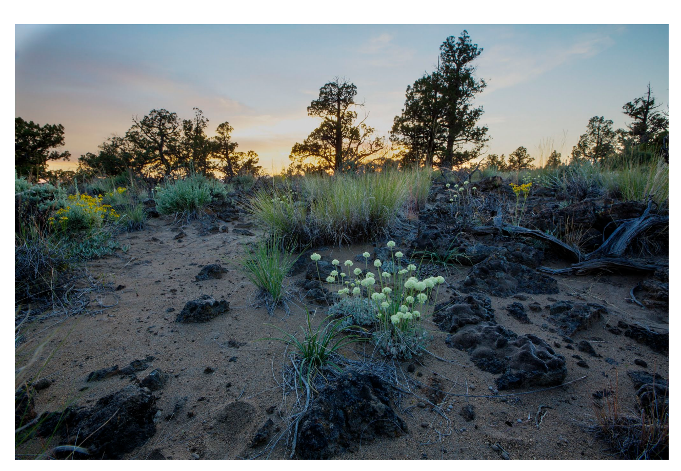
Oregon Badlands Wildnerness. June 2016.