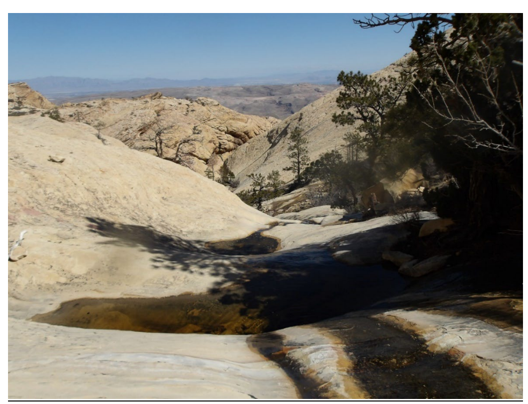
Tinaja system in Little Zion Area