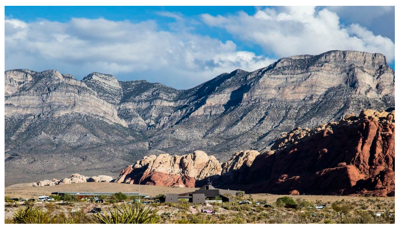
A view of the red sandstone Calico Hills, with the gray limestone Spring Mountains.

Other infrastructure projects within the NCA, that have completed NEPA documentation and have funding associated with them, are being delayed by limited staff capacity in the BLM support services division. The staff that support the NCA are doing an incredible job but have substantial workloads.