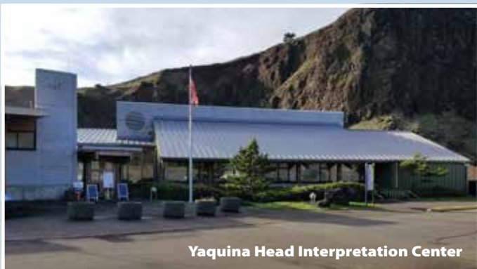
Yaquina Head Interpretation Center