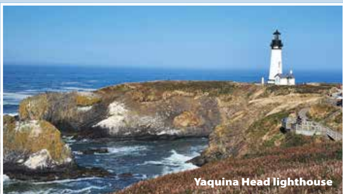
Yaquina Head lighthouse