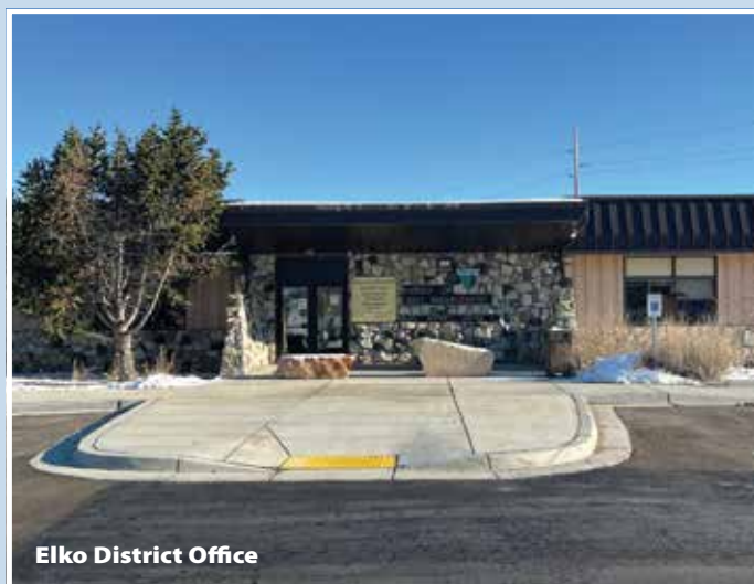
Elko District Office