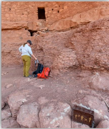
1: Drop backpacks and other bulky items outside the entrance.