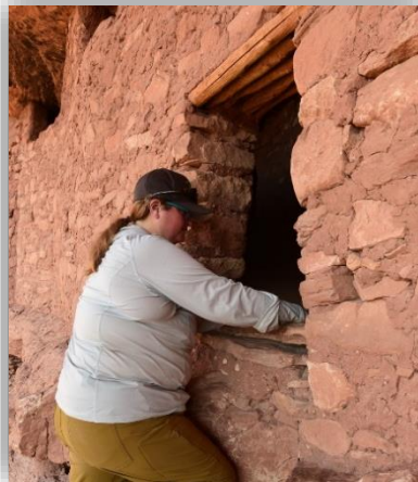
2: Place both your hands on the flat stone at the doorway and push yourself inside.