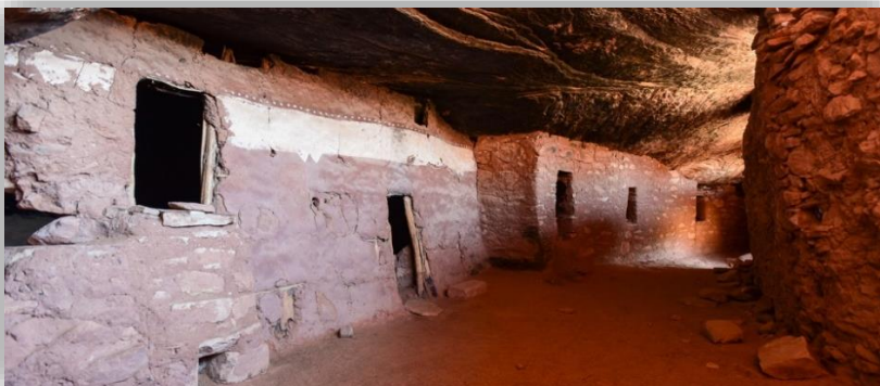
A view inside the Moon House courtyard

Please do not pull on the walls to enter or exit the courtyard!