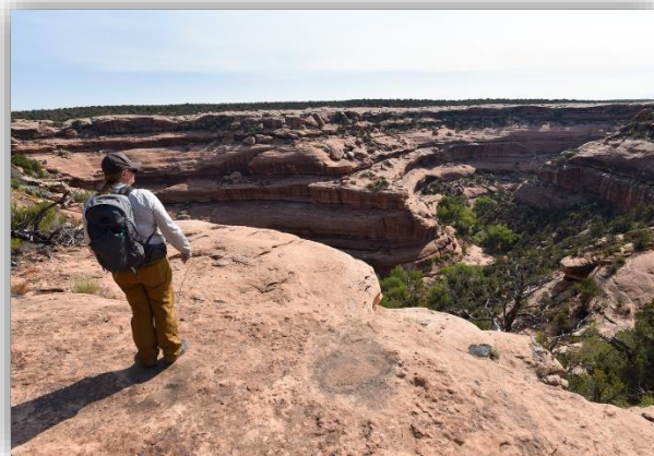
Overlooking the rim of McCloyd Canyon

Permits or passes are not required for dispersed camping along Snow Flat Road. For more information about overnight use on Cedar Mesa, visit Kane Gulch Ranger Station (open seasonally) or contact the Monticello Field Office at 435-587-1500.