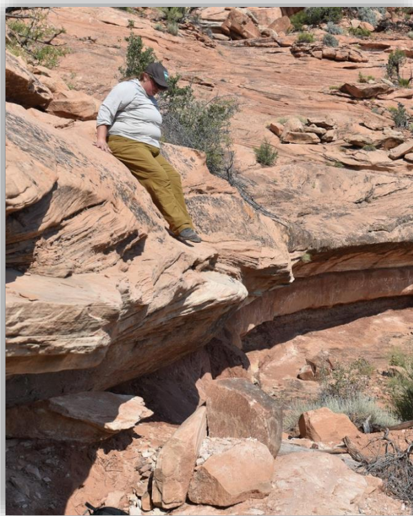
The "crux" of the hike, a steep sandstone ledge that ends in a four-foot drop. Use friction to help lower yourself.

Expect the hike to take up to two hours one way or four hours round trip.