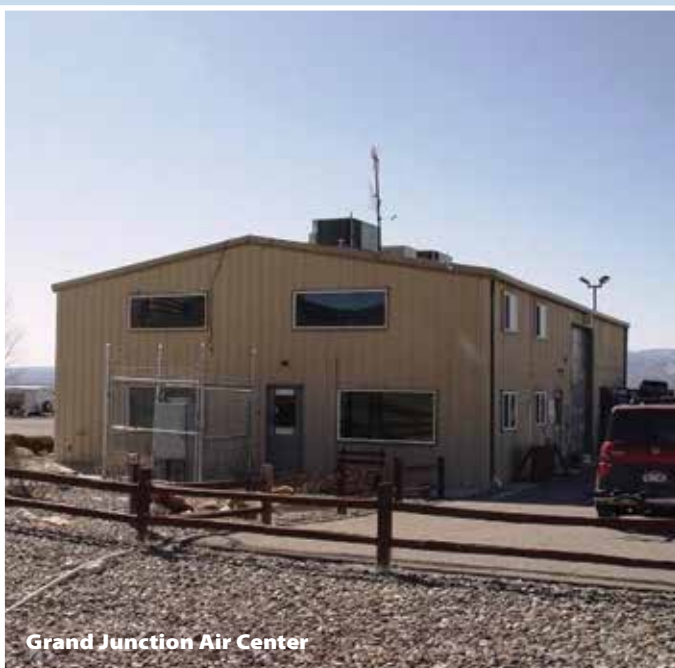
Grand Junction Air Center