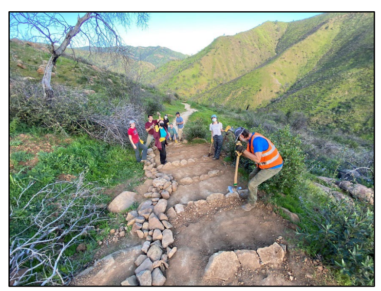
Youth volunteers working on trail construction.

The BLM has worked to provide access to and involvement with the monument including support of youth involvement through AmeriCorps; engagement with Tribal governments on management actions, cultural surveys and ethnographic studies; and cooperation with Tuleyome to provide interpretive programs, projects, and nature hikes, focusing on diverse communities.