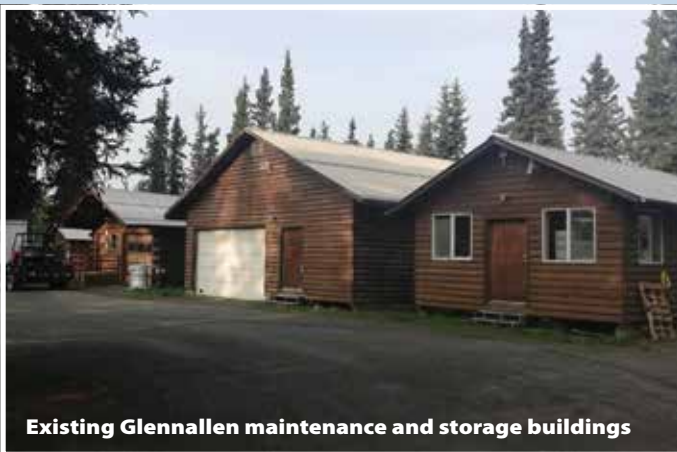
Existing Glennallen maintenance and storage buildings