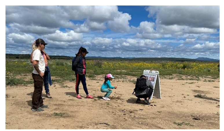
Interpretive program participants viewing images of petroglyphs found in the NCA.

Throughout FY22, El Malpais park rangers conducted several interpretive programs. One of the programs included information on petroglyphs, historic culture, and their tie to the landscape. Discussion also included message on leave no trace principles, recreation opportunities, and wildlife in the area.