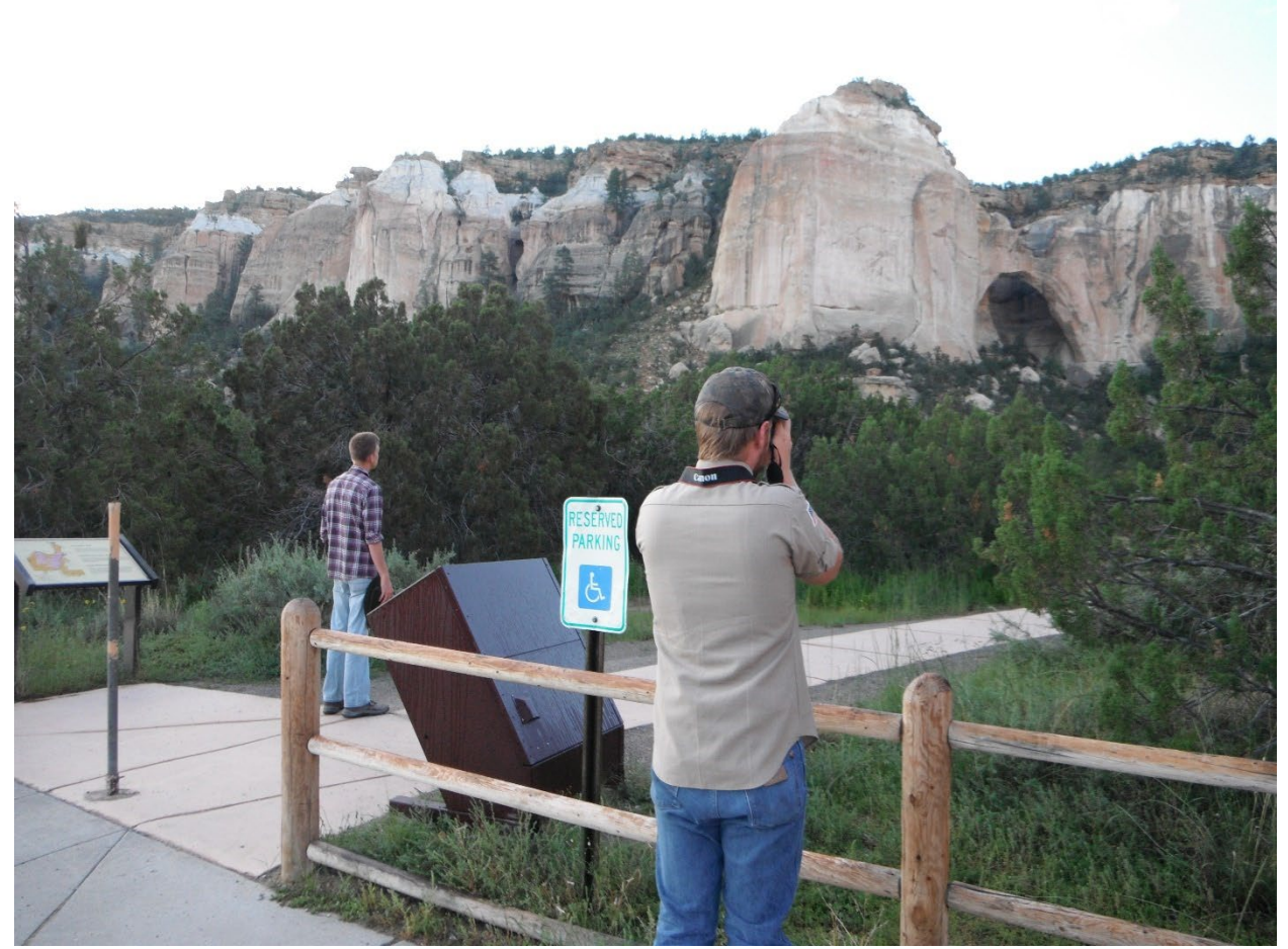
Visitors enjoy an early morning hike at La Ventana Arch

In FY22 the El Malpais NCA Ranger Station has been open three days per week (Friday through Sunday) and has received steady visitation throughout the year. The Ranger Station received 1,787 visitors and the overall El Malpais NCA received 213,814 visitors in FY22. Historically, visitor use numbers recorded in the database are collected through a variety of methods including estimates made by recreation staff based on data from the nearby National Park Service's El Malpais Visitor Center and El Malpais' special recreation permits. Recreation staff deployed new TRAFx vehicle counters in FY21 with more installed in FY22. In the Recreation Management Information System (RMIS), the past estimated annual visitation reported was less accurate than data that TRAFx counters now provide. Visitation in the NCA is steady throughout the year with the highest overall use from spring to summer. Elk and pronghorn hunting are popular in the Conservation Area with open seasons from August through December. BLM expects that visitation increase and increased interest in outdoor activities.