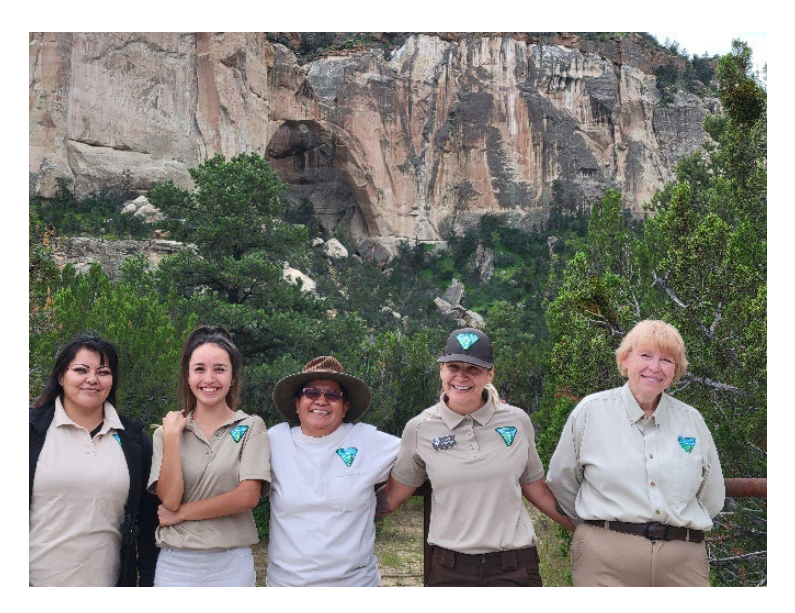
Conservation Area Volunteers with Park Ranger at La Ventana Natural Arch.

In FY22, the Conservation Area hosted five volunteers whose hard work and efforts contributed to memorable experience for visitors. Volunteers worked on trail and facility maintenance, and vegetation removal in the developed recreation sites and at the Ranger Station.