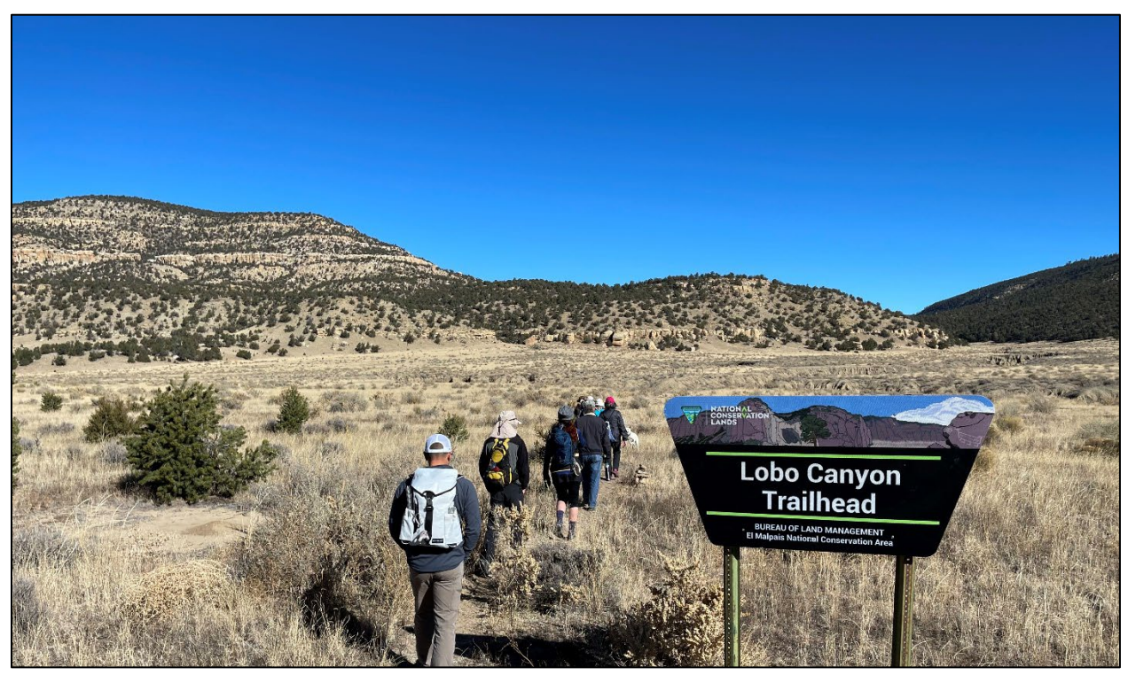
Visitors enjoy a Ranger-led hike to Lobo Canyon Petroglyphs.

As all units have experienced change in visitation throughout the COVID-19 pandemic, El Malpais staff have had to adapt their on-the-ground visitor interactions and facility maintenance techniques. To protect resources and prevent resource degradation, field staff is needed on the ground with the increased of visitation. Off-road driving and user-made campsites are increasing within the wilderness areas in the Conservation Area. The Conservation Area Park Rangers are a big part in stewardship outreach to public. A priority in FY23 is to fill a supervisory park ranger position to assist with El Malpais' day-to-day operations and two seasonal park ranger positions. Interpretive programs have been minimized throughout the past three years due to COVID-19 and FY23 allows the continued opportunity to create more in-person ranger-led visitor experiences.