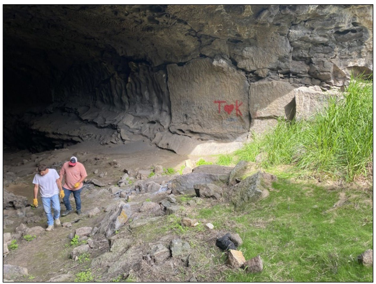
Bear Trap Cave

One challenge is timely sign inventory and replacement, given the remoteness and size of the Monument. Location and directional signs are targeted by recreational shooters requiring more frequent replacement. Additionally, vandalism of Bear Trap Cave is a constant issue. Well known and easily accessed, the cave is a favorite local party spot. Monument staff have plans to address the Bear Trap Cave vandalism and replace damaged signs in FY 23.