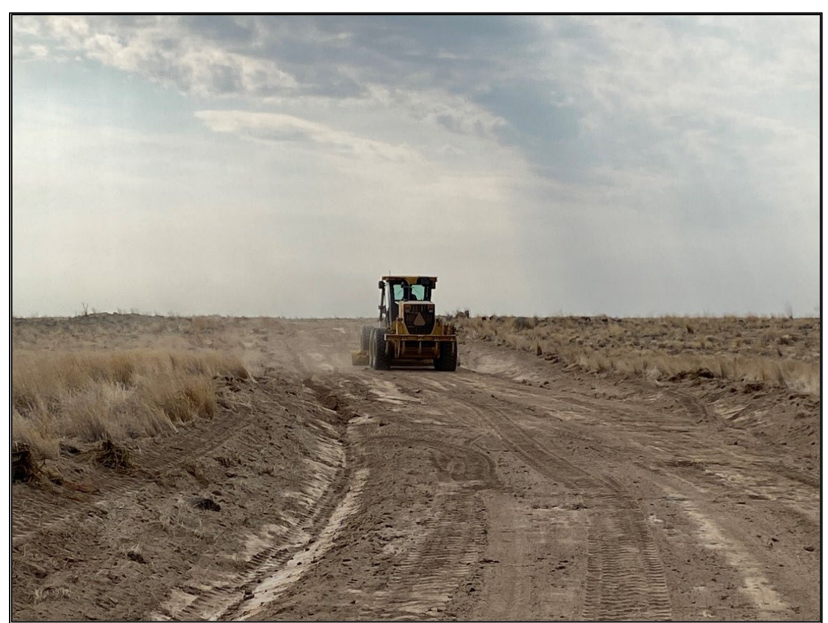
Road work on the Arco-Minidoka Road

The BLM is implementing proactive measures to create and maintain a climate resilient landscape. In 2022, several miles of road were upgraded to improve fire response times when wildfire strikes the southern end of the Monument. BLM continues to employ chemical treatments on post-fire rehabilitation seedings, which allows the seeding to become established and better able to withstand weed invasions. BLM also partnered with Pheasants Forever in the Fall of 2022 to plant sagebrush seedlings to reestablish the healthy sagebrush steppe which is one of the reasons the Monument was designated. On the southern end of the Monument in the Burley Field Office, 2,547 acres of Split Butte North restoration area were drill seeded, 1,997 acres were aerially seeded with sagebrush and 3,993 acres were aerially seeded with grass.