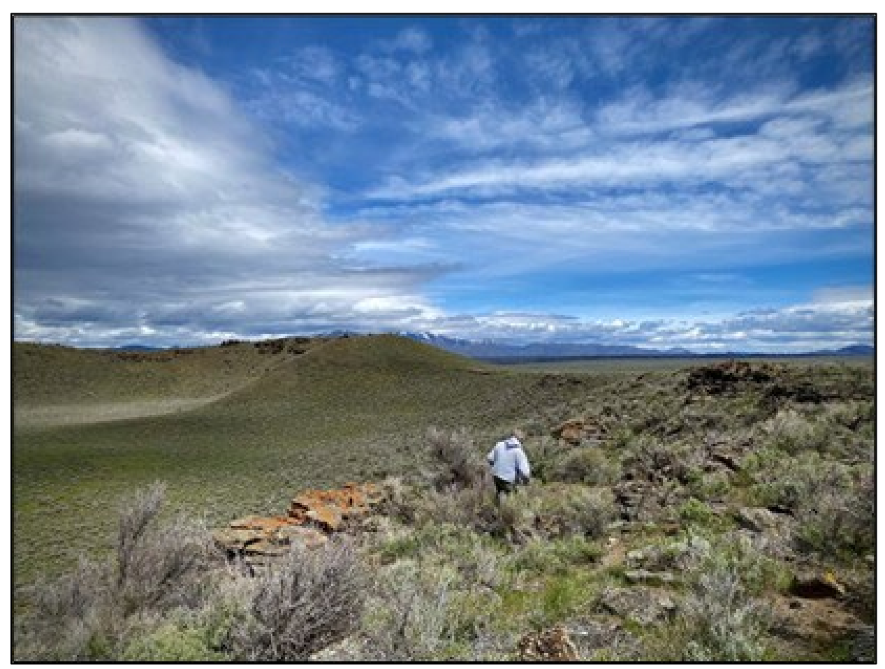
Big Blowout Butte in Laidlaw Park

While most visits to the interior of the Monument are self-directed, BLM staff did lead a group of 10 photographers from the Magic Valley Camera Club on a tour in May 2022. The group visited Snowdrift Crater and Big Blowout Butte in Laidlaw Park, as well as Little Park and Paddelford Flat kipukas. The group was able to photograph a wide variety of geologic features, vegetation, and fauna.