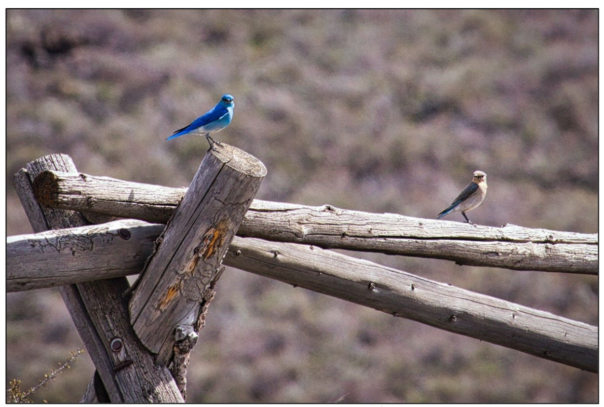
Bluebird Couple at Snowdrift Crater

The BLM partnered with The Nature Conservancy to apply for Land and Water Conservation Fund FY 25 Core Project funds for the potential acquisition of the Huddles Hole and Snowdrift Crater Farm properties. These private inholdings contain approximately 1,825 acres and 320 acres, respectively. If approved, acquisition is anticipated within 18 months of receiving the funds. The acquisition will provide more contiguous management of federal lands with the Monument.