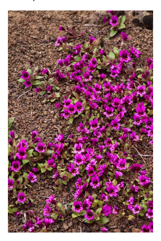
Monkey Flower at Carey Kipuka

Invasive weed populations are increasing overall in the Monument. This is evident from herbicide weed treatment data points and weed inventories that occur within the Monument each year. Rush skeleton weed is expanding so rapidly that it is beyond the capacity of ground treatments utilizing UTV and truck mounted sprayers to control. Large wildfires over the last decade have cleared much of the native sagebrush steppe of plants that would have offered some protection from weeds.