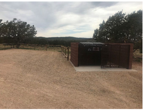
Trash Receptacle at Pyramid Ridge Campground