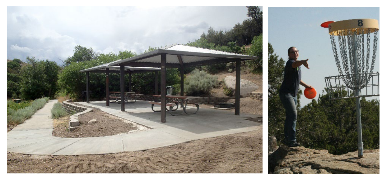
Rock Corral Day Use Site