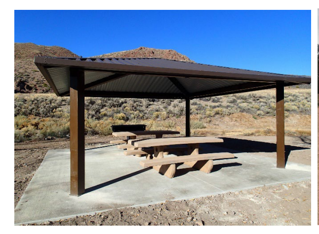
Large Pavilion at Hanging Rock Campground