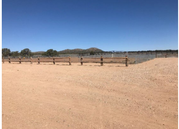
Three Peaks RC Car Track