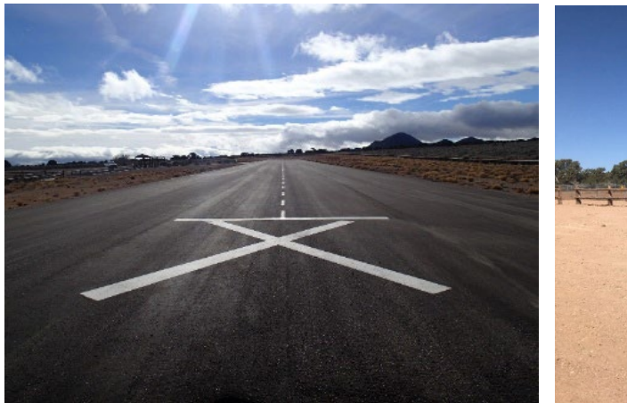
Three Peaks Model Port