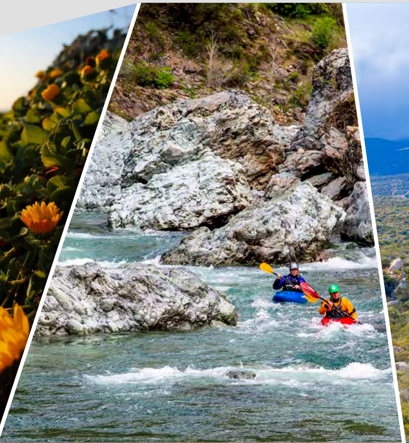
North Fork American River, Mother Lode Field Office