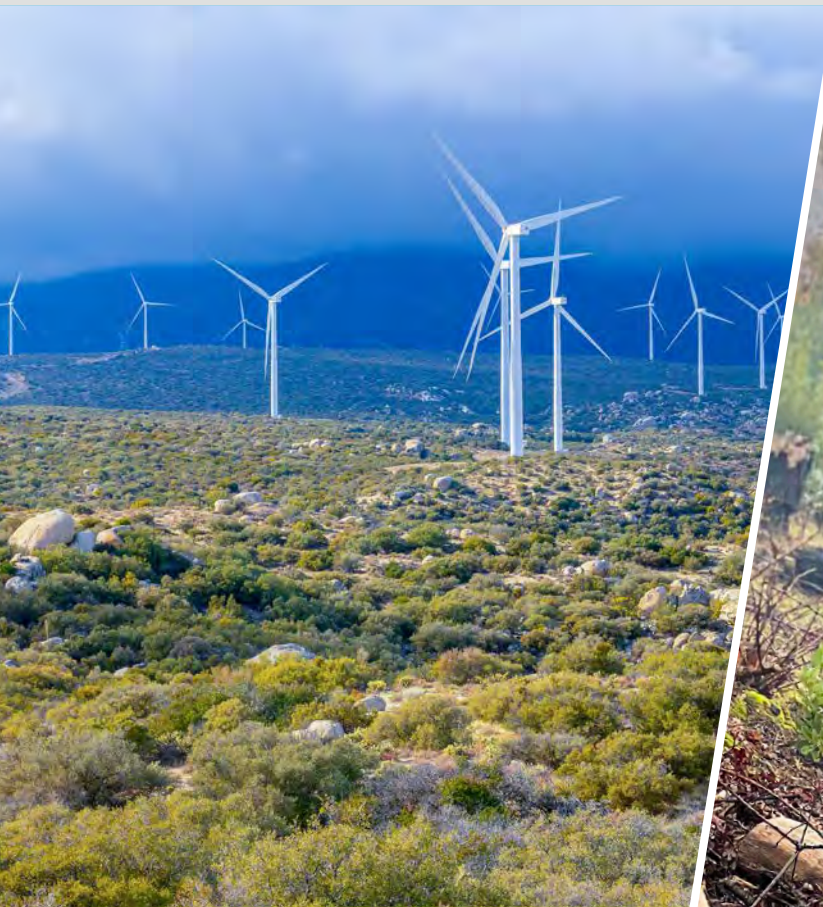
McCain Valley, El Centro Field Office