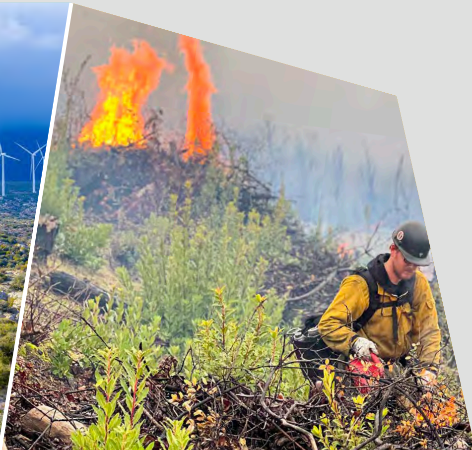
Swasey Recreation Area, Redding Field Office