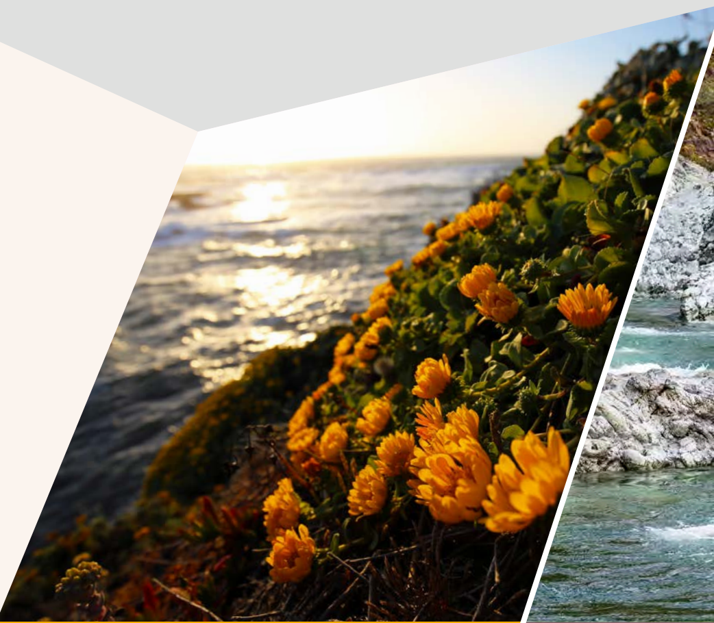
Point Arena-Stornetta Unit, Ukiah Field Office