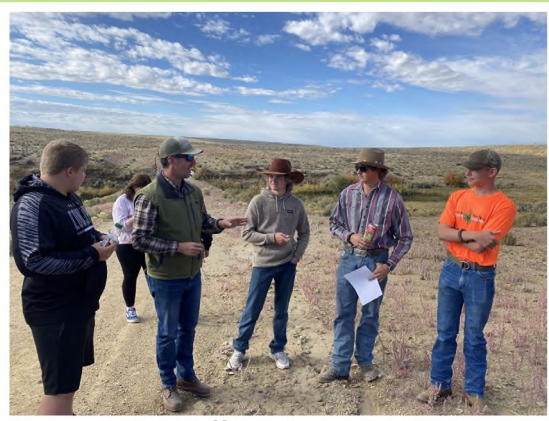
RSFO Staff Leading a Field Trip

RSFO distributed 534 Interagency Passes in FY22. 415 of these passes were a part of the Every Kid Outdoors program. Through the fall and winter seasons, RSFO staff distributes these passes along with Junior Ranger booklets to every 4th grade classroom in our Field Office. RSFO staff works to accommodate every request made by teachers to provide interpretation and professional guidance in their classrooms and on field trips, to engage and enrich our future land stewards.