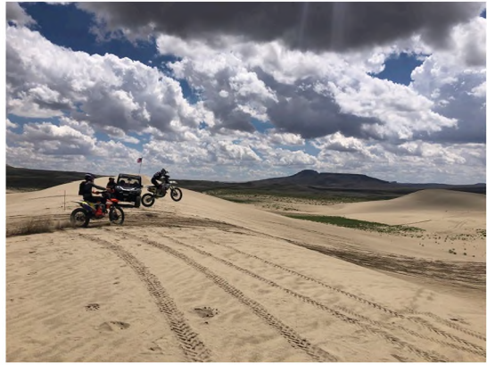
Motorcycle Racers at the Killpecker Sand Dunes

The RSFO currently manages 14 Special Recreation Permits, including outfitters, tour groups, and competitive events. In 2022 RSFO hosted the first competitive motorcycle race in the Killpecker Sand Dunes Open Play Area, in collaboration with WORRA and the Killpecker MCs, a local user group. The fees collected from this event will go back to the greater Killpecker Sand Dunes area, improving interpretive signage at nearby cultural and recreation sites.