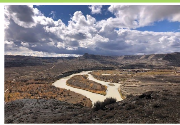
Overlook of the Green River on Wilkins Peak

The RSFO is working on several improvements to our recreational facilities, including collaborating with the NOC to develop the North Table Rock Camping area into a second gateway to the Killpecker Sand Dunes OHV area. The RSFO is collaborating with local user groups to plan an expansion of the Wilkins Peak Mountain Bike Trail System with associated facilities, as well as constructing an ADA accessible hiking trail outside of the town of Green River. The RSFO is also working to improve signage and monitoring at our Wilderness Study Areas, and interpretive signage at some of our recreation and cultural sites.