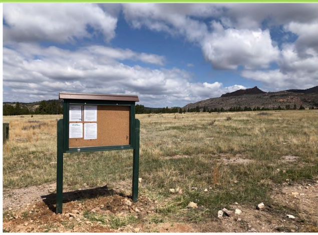
Kiosk at Old Quarry Trailhead

The BLM Newcastle Field Office's approval of the construction of hiking and biking trails was a major milestone for outdoor enthusiasts and nature lovers in the area. The new trails, stretching over five miles on BLM land, offer an exciting opportunity for people to explore the beautiful and rugged terrain of the Wyoming countryside. Located just five miles east of Newcastle along U.S. Highway 16, the trails are easily accessible for both locals and travelers alike. In order to provide visitors with a better experience, the BLM has taken the initiative to install a one-panel kiosk at the trailhead parking area. The kiosk is designed to offer maps, information, and guidelines about the trails system, ensuring that everyone who uses the trails is aware of the rules and regulations.