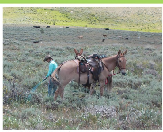
Horseback Weed Spraying at Johnny Behind the Rocks

Provided funding to the LFOs weed treatment agreement with Fremont County Weed and Pest District. The funding provided specifically focuses on addressing noxious and invasive plants in the Johnny Behind the Rocks Special Recreation Management Area. By inventorying and treating invasive species along use areas, this agreement will ensure trail users remain clean, while also limiting the spread of these species within the area and county--in-turn also protecting rare and endemic plant populations