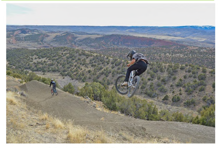
Johnny Behind the Rocks J-Line Trail